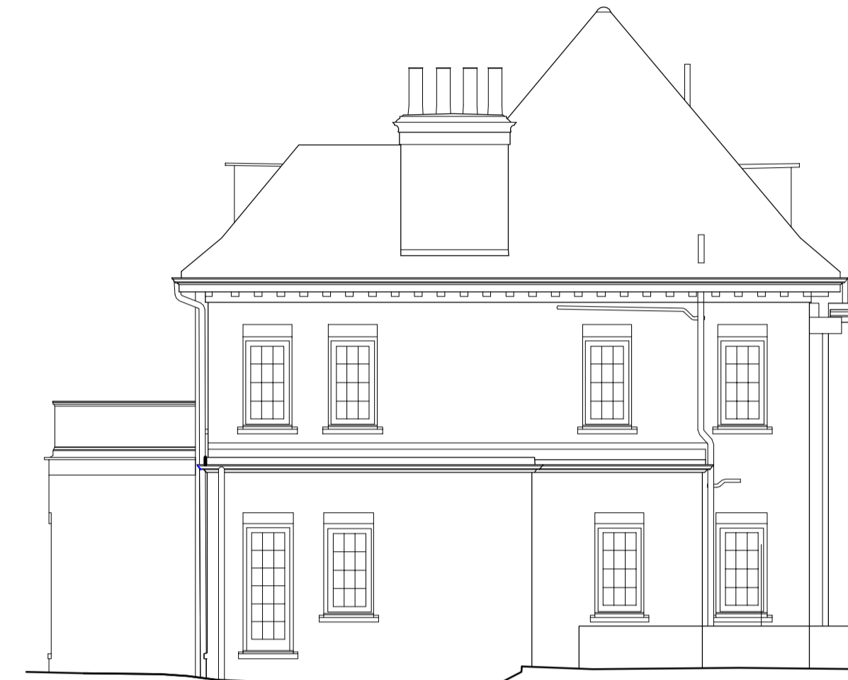
North (Side) elevation B-B 1:100 @ A1