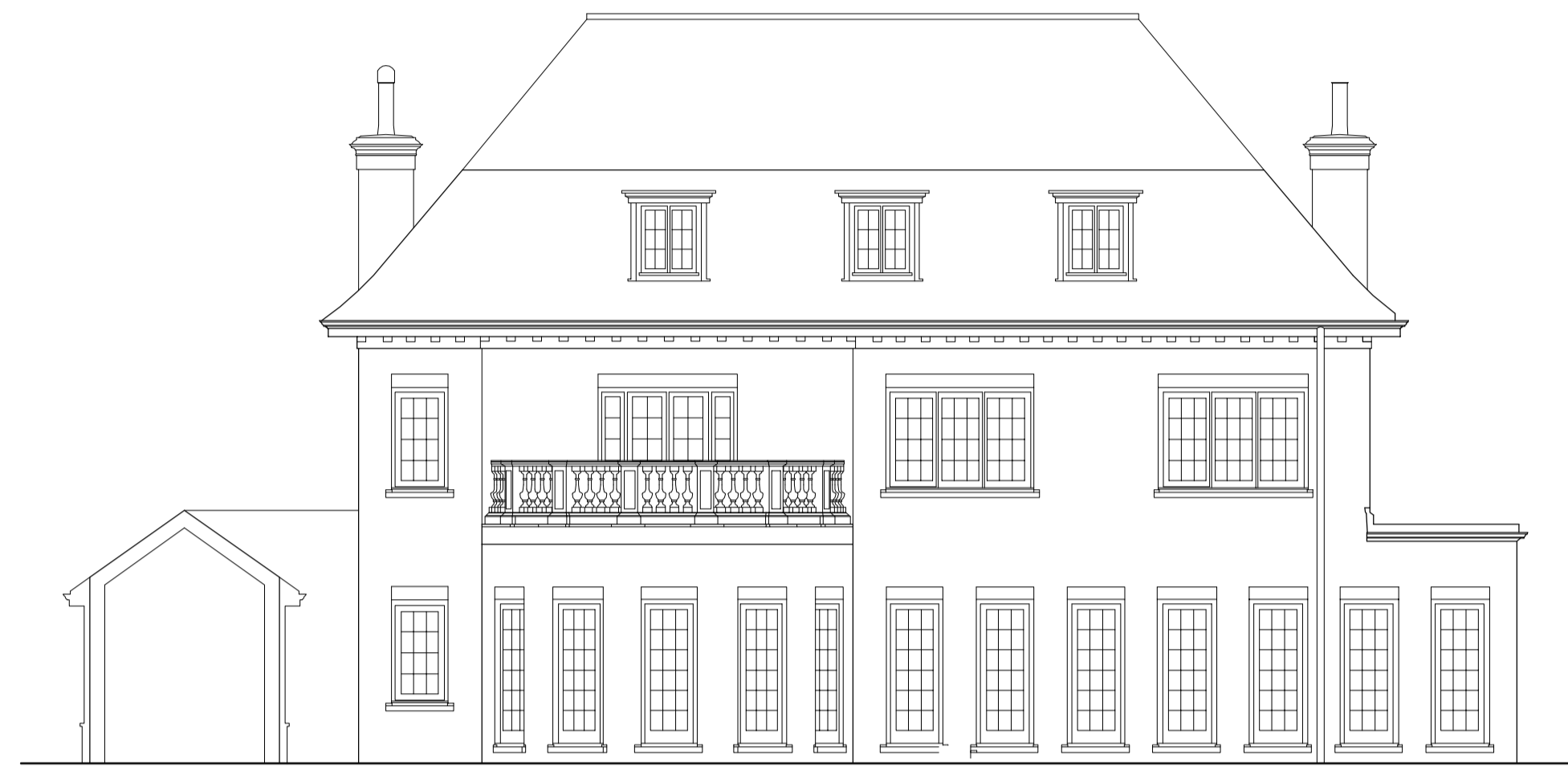
Main house front elevation A-A 1:100 @ A1