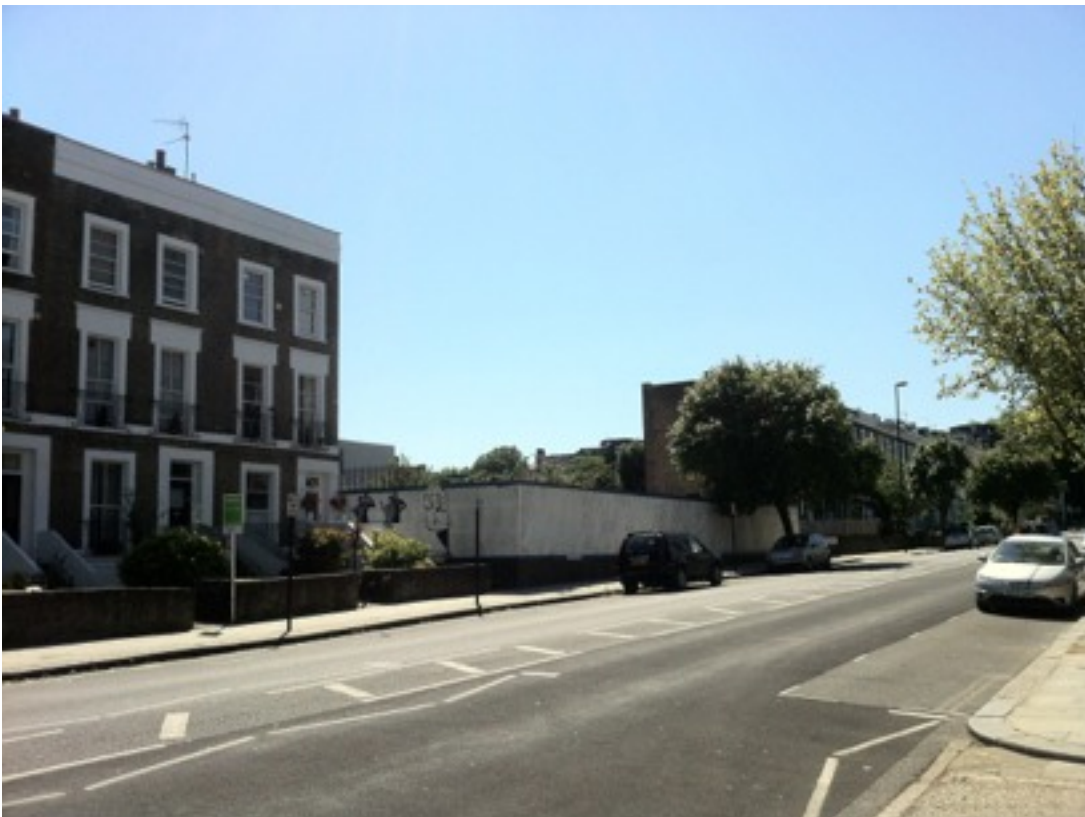
Photo 2: 23.07.2012; from north side of Prince of Wales Road, looking SW - development site in middle of shot (behind hoarding)