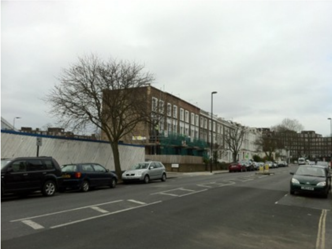
Photo 1: 08.03.2012; from north side of Prince of Wales Road, looking SW - development site to left (behind hoarding)