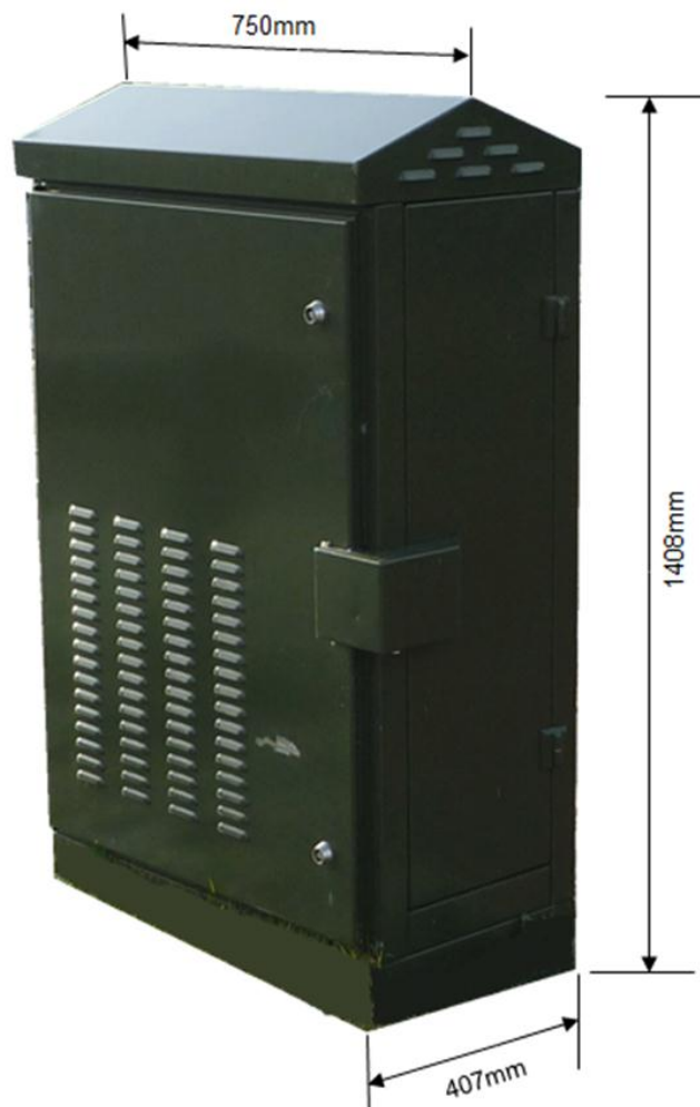
ECI 128 Cabinet