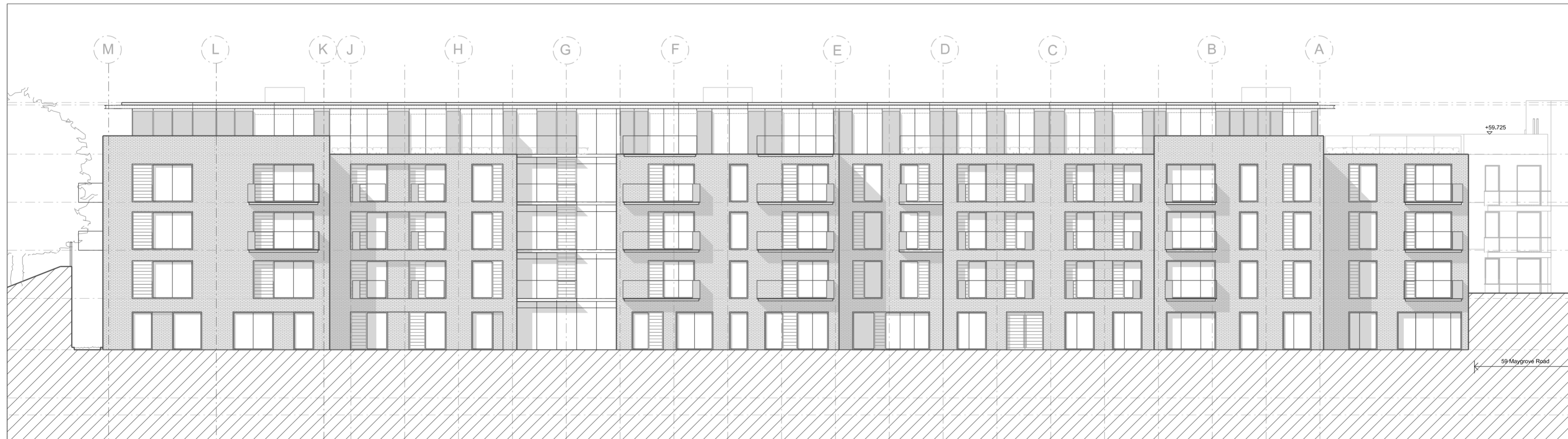
A4000 North Elevation BB