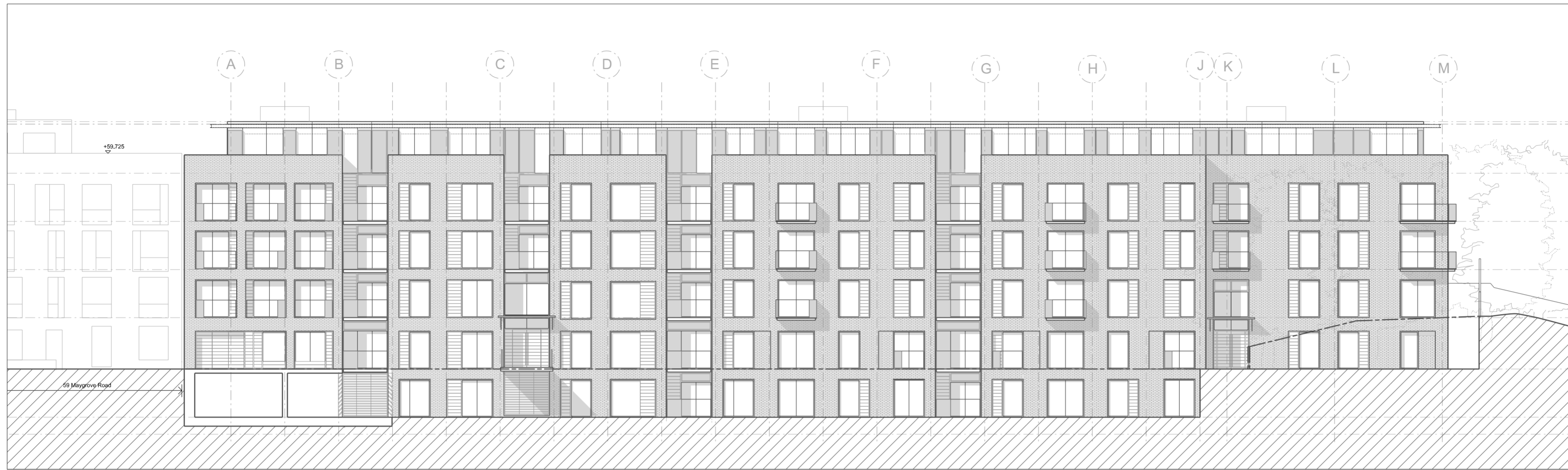
A4000 South Elevation AA