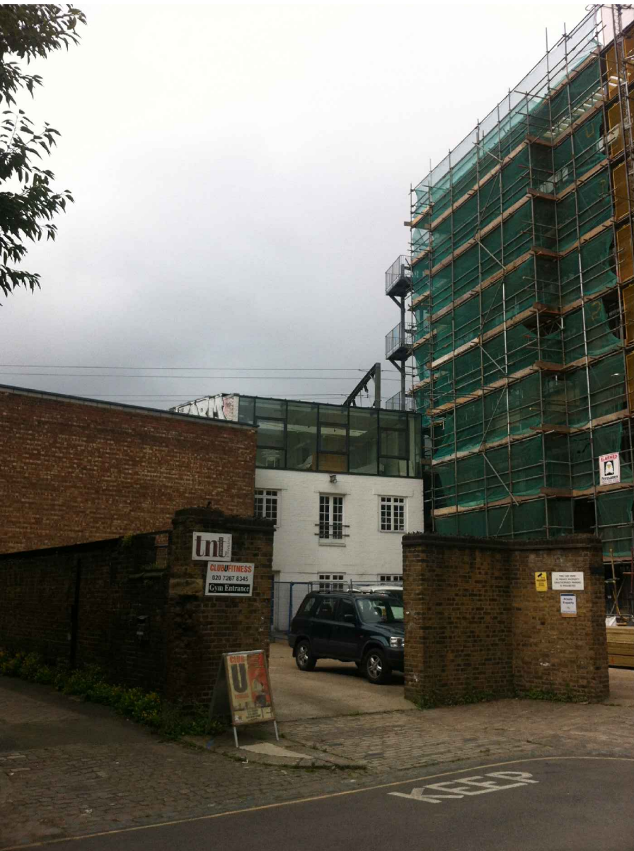
view from Ryland Road, gap in wall will be infilled to form enclosure to bin store