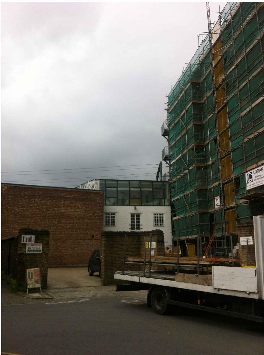
view from Ryland Road, Portland House on the right