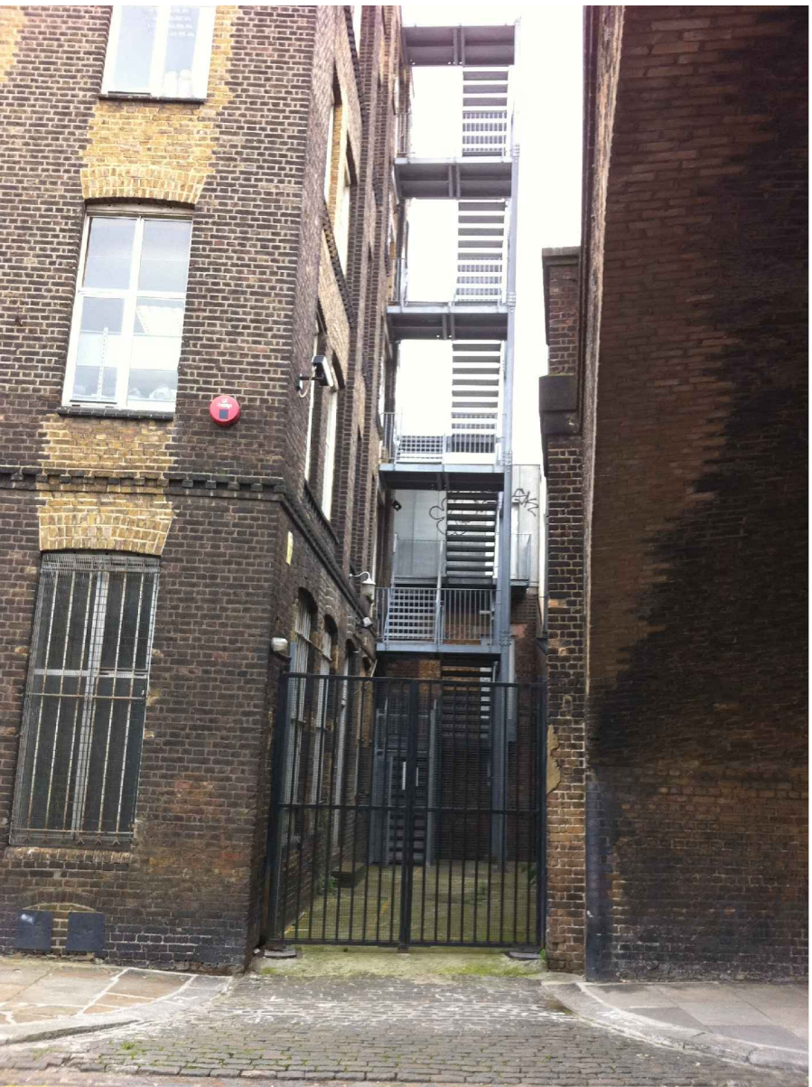
view from Wilkin Street, Portland House on the left and the railway viaduct on the right