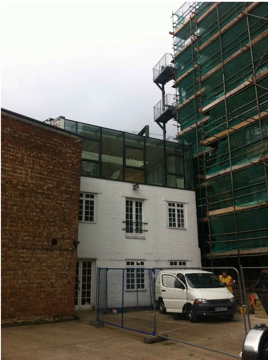
view from car park