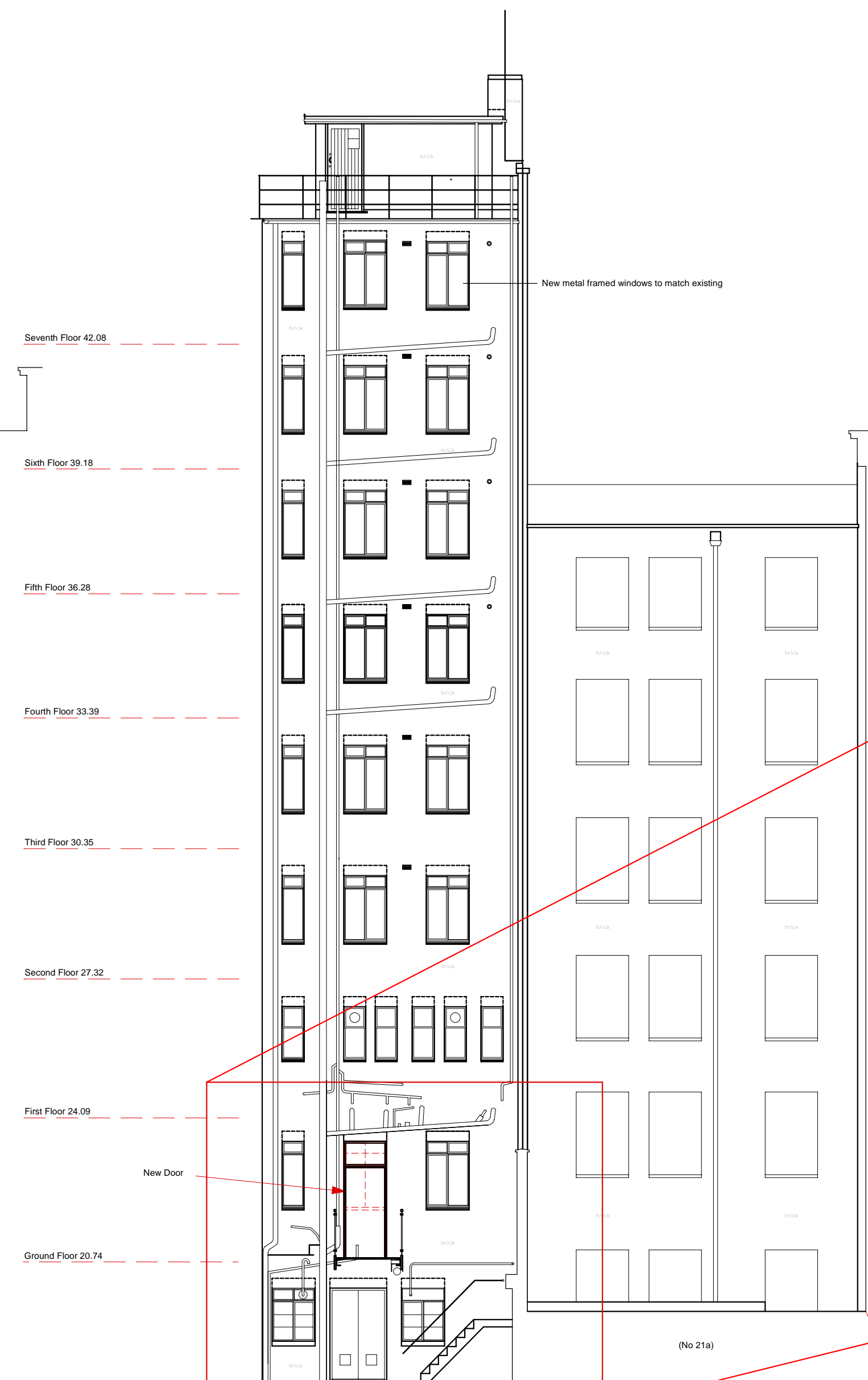
1:100 Proposed South West Elevation