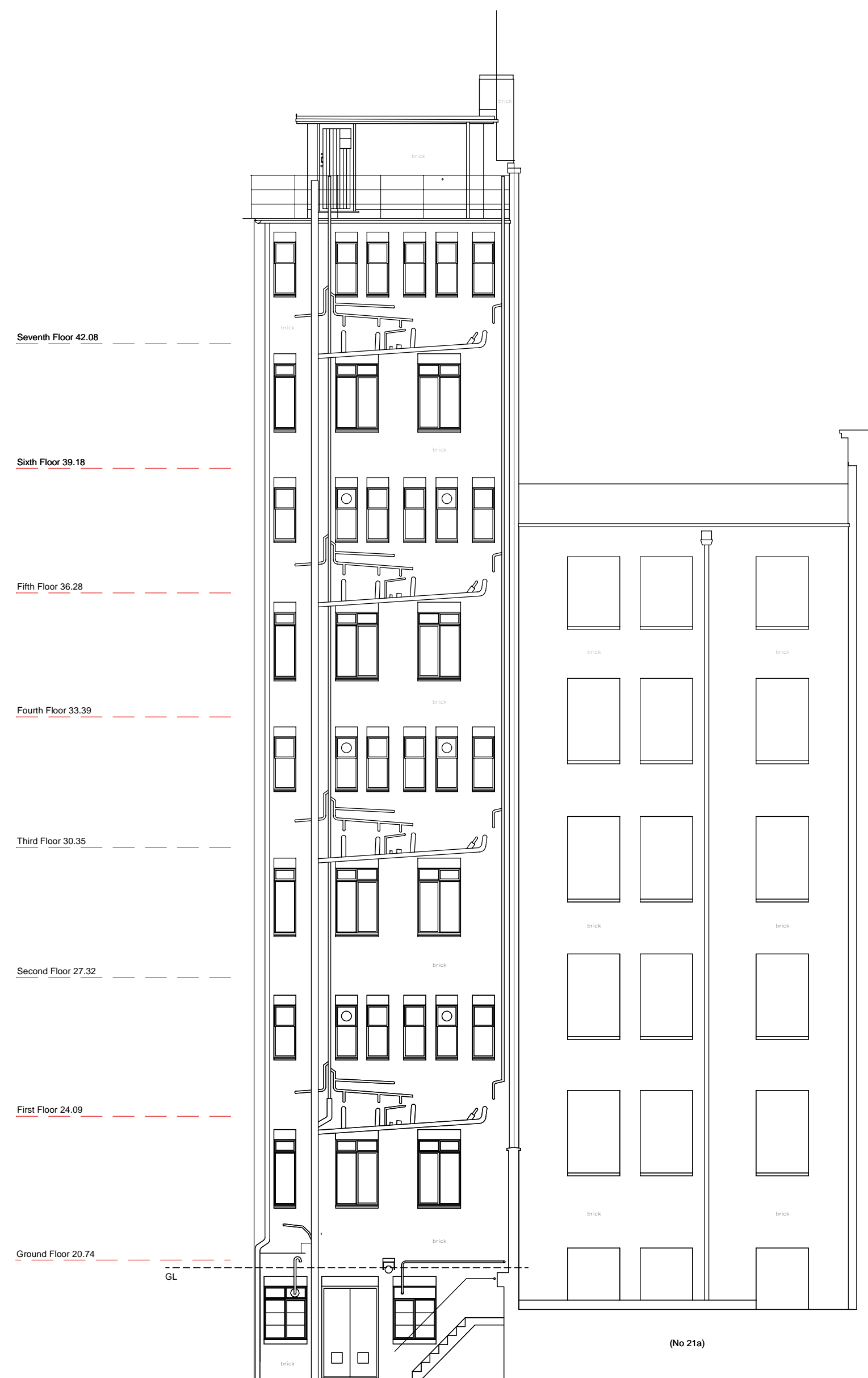
1:100 Existing South West Elevation

South west Courtyard Elevation: Proposed