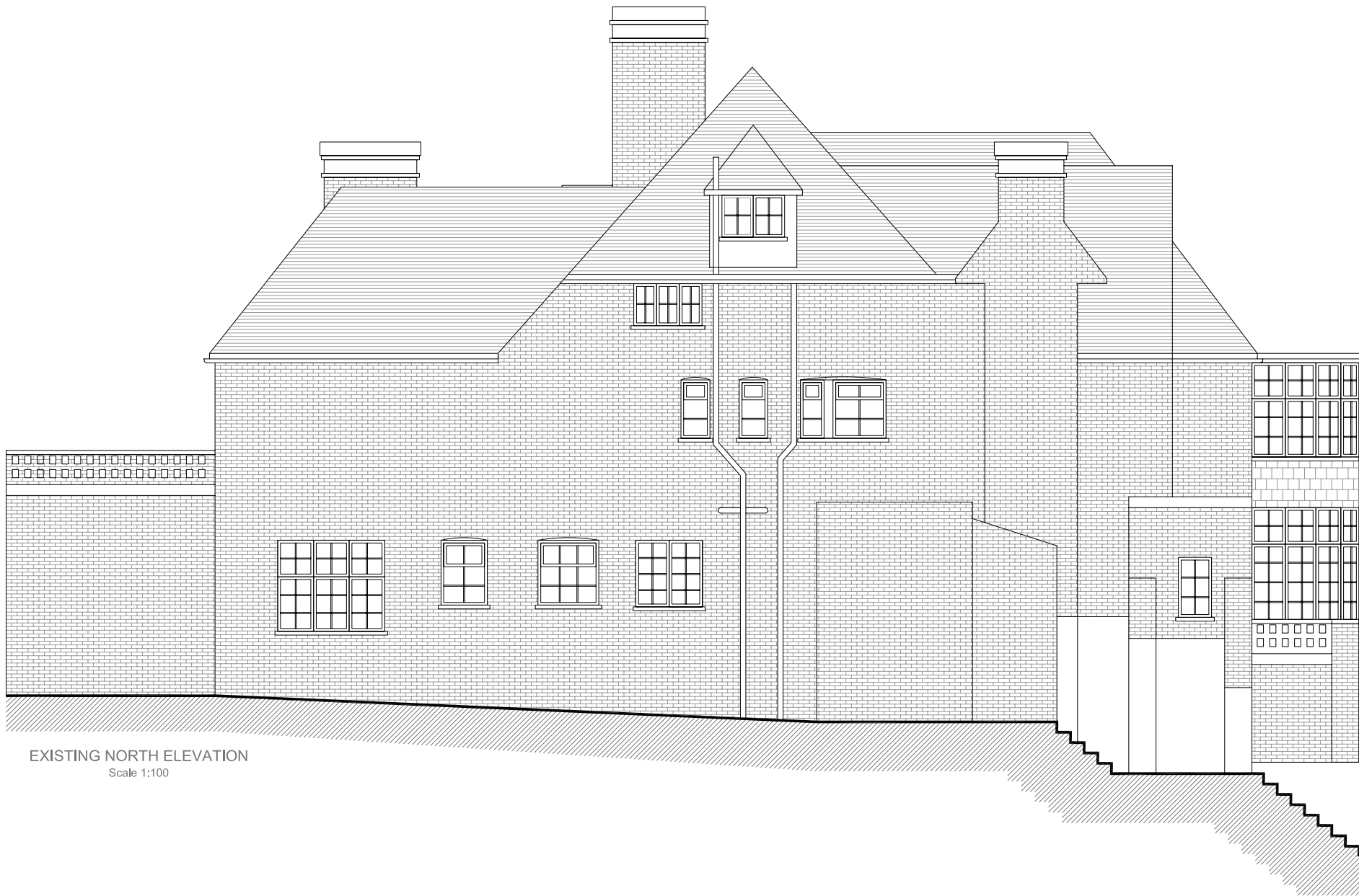
EXISTING NORTH ELEVATION Scale 1:100