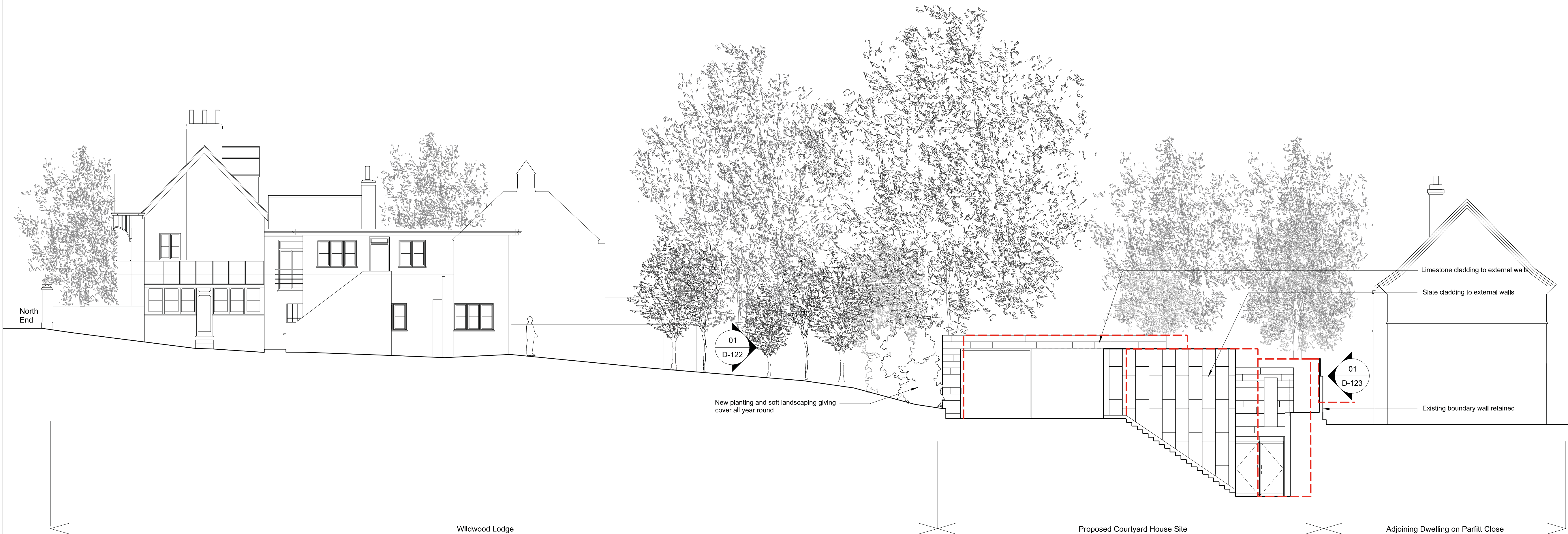
02 NORTH EAST ELEVATION D-123 PROPOSED 1:100