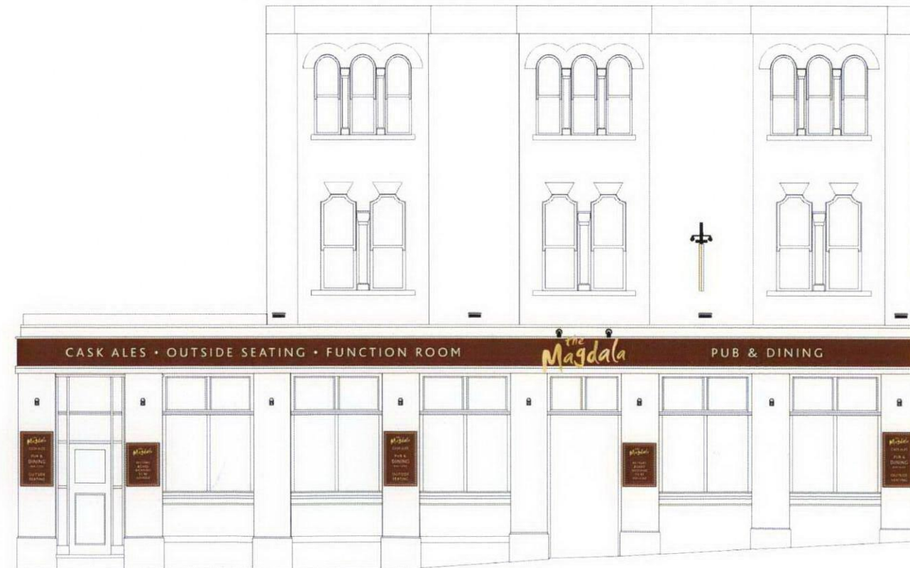
Front Elevation - Scale 1:100