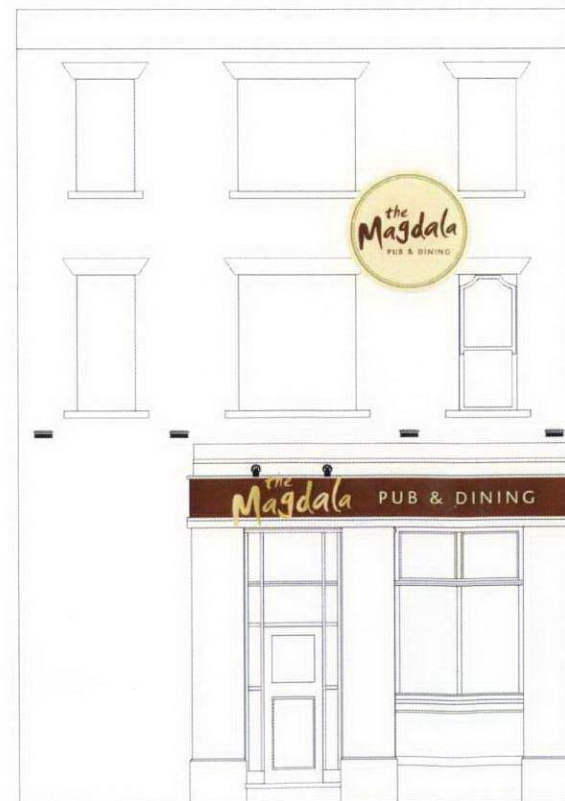
Side Elevation - Scale 1:100