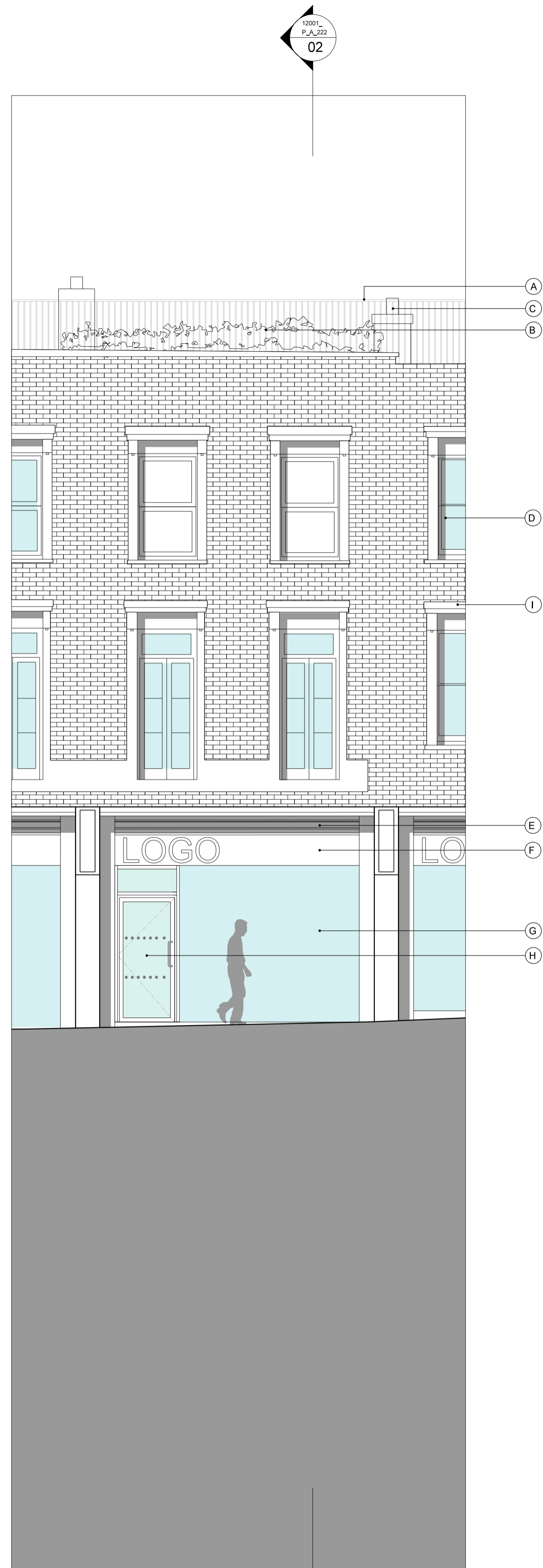
01 CHALK FARM ROAD - BAY ELEVATION