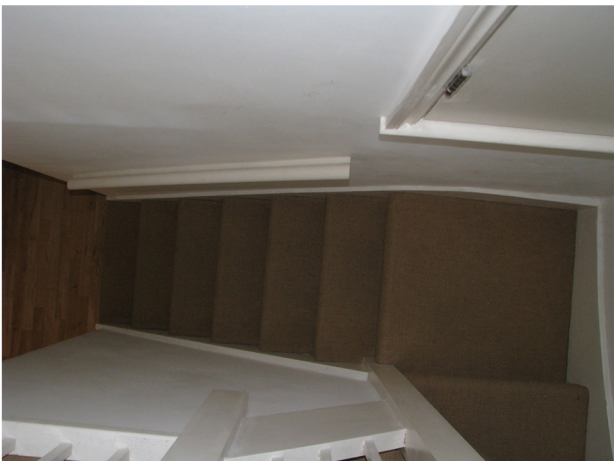
Flat 3 stairwell