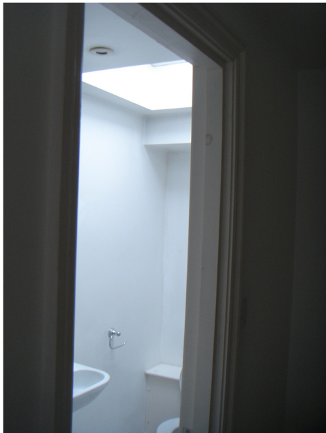
View of shower room