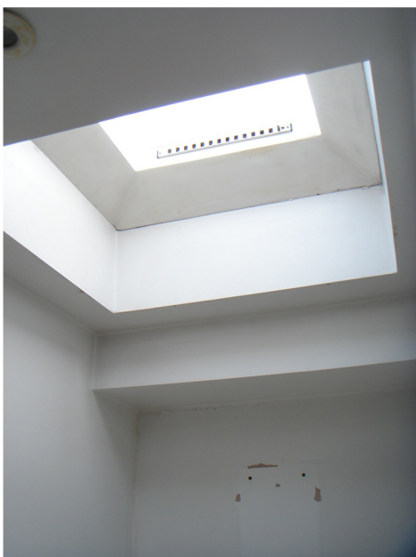
Internal view of existing rooflight