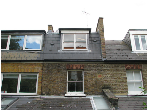
Rear elevation of Flat 3