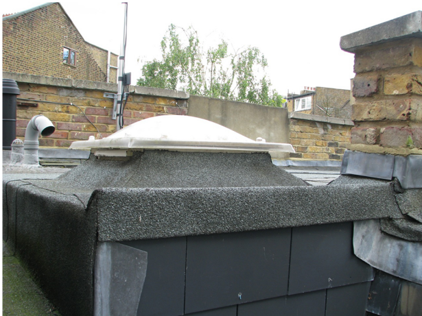
External view of existing rooflight