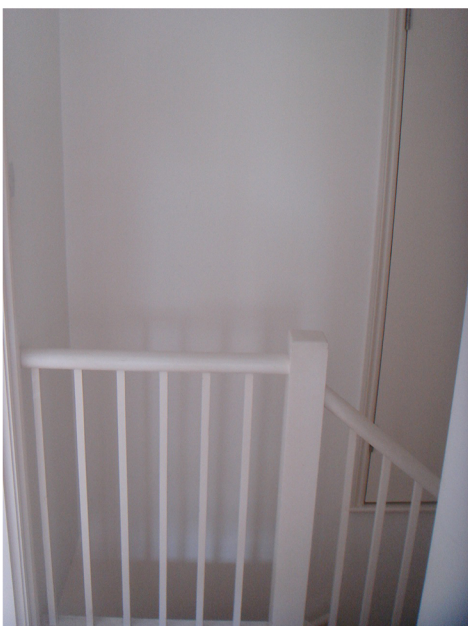
View of landing