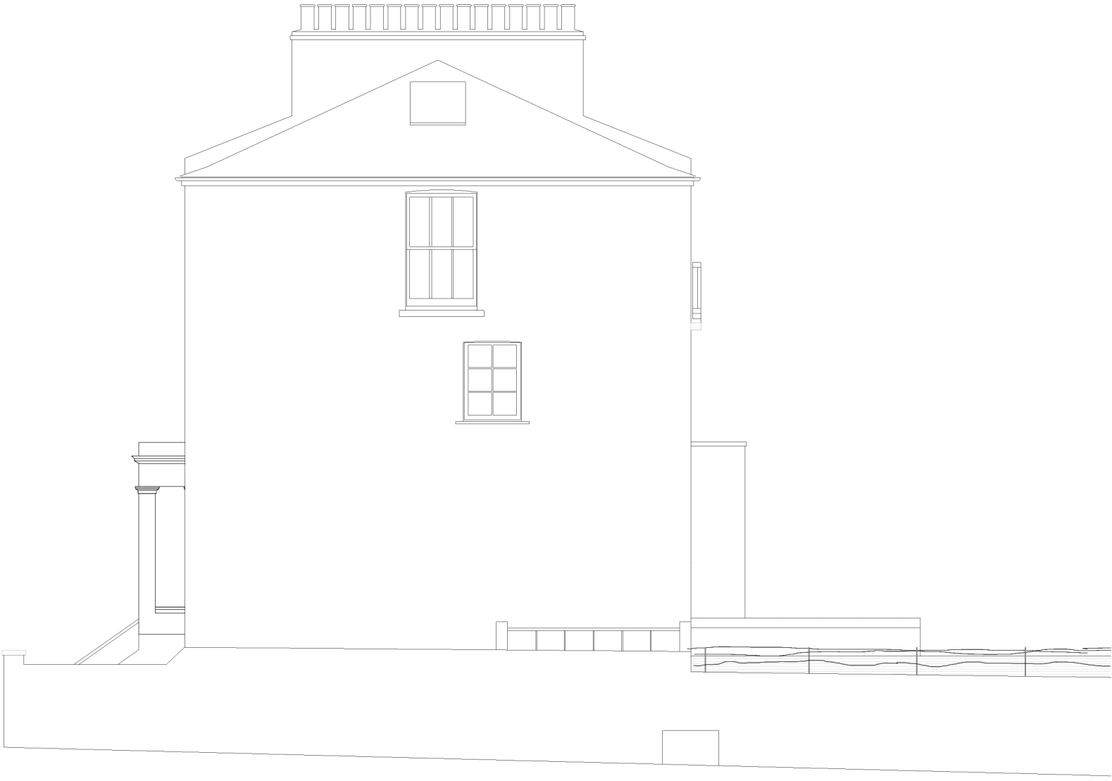
Flank Elevation 1:50 @ A1