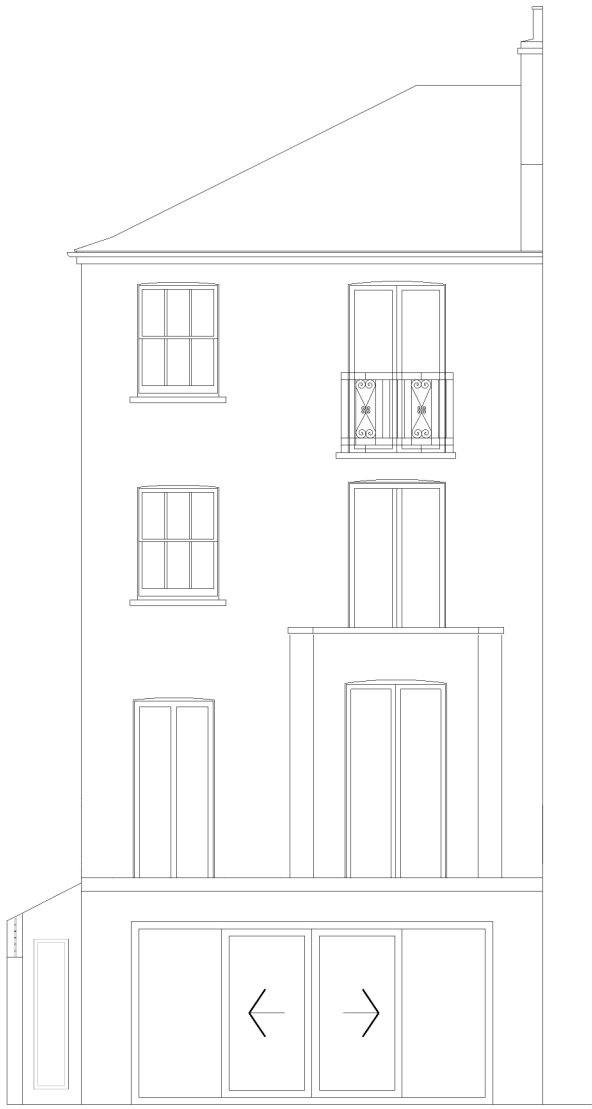
Rear Elevation 1:50 @ A1