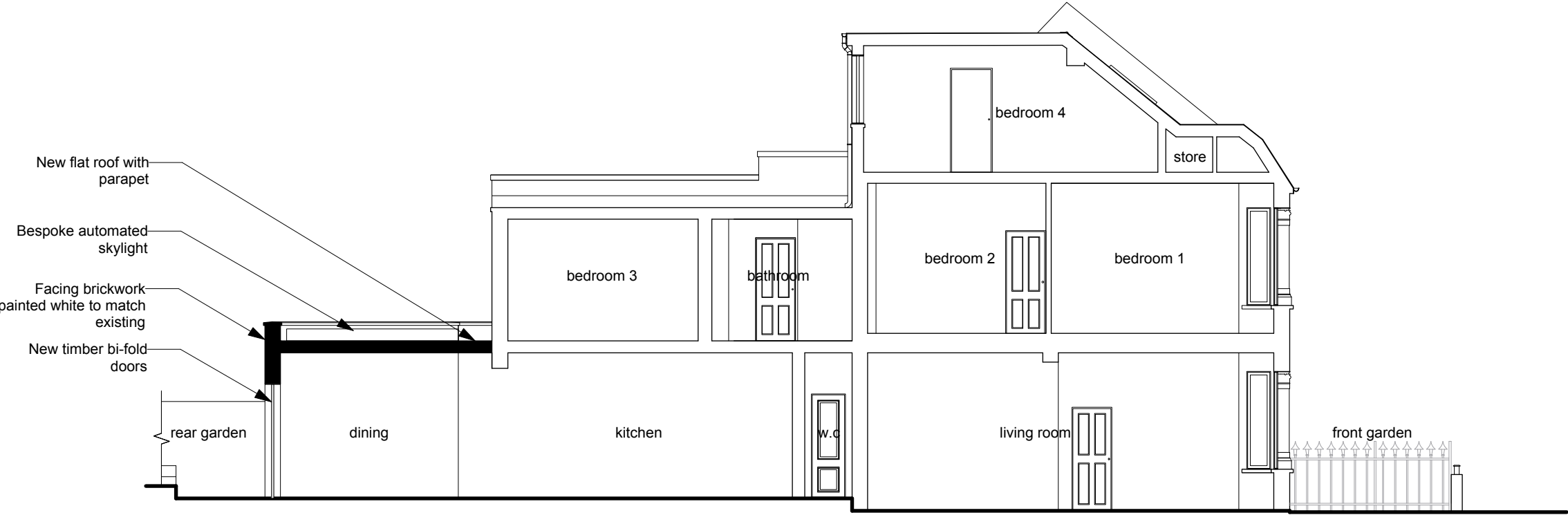
PROPOSED SECTION A - A

Notes: This drawing is the copyright of Spheron Architects (Ltd) and may not be used without their consent. Do not scale from these drawings. The contractor is responsible for checking all dimensions before work starts. Any discrepancies to be brought to the attention of the Architect immediately.