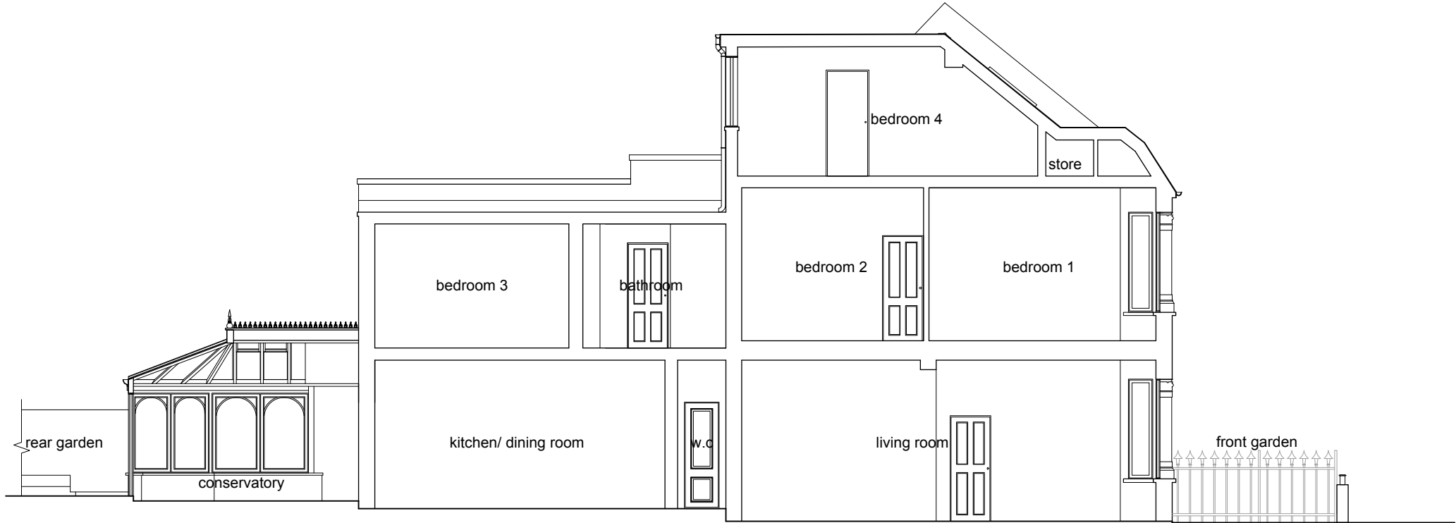
EXISTING SECTION A - A

Notes: This drawing is the copyright of Spheron Architects (Ltd) and may not be used without their consent. Do not scale from these drawings. The contractor is responsible for checking all dimensions before work starts. Any discrepancies to be brought to the attention of the Architect immediately.