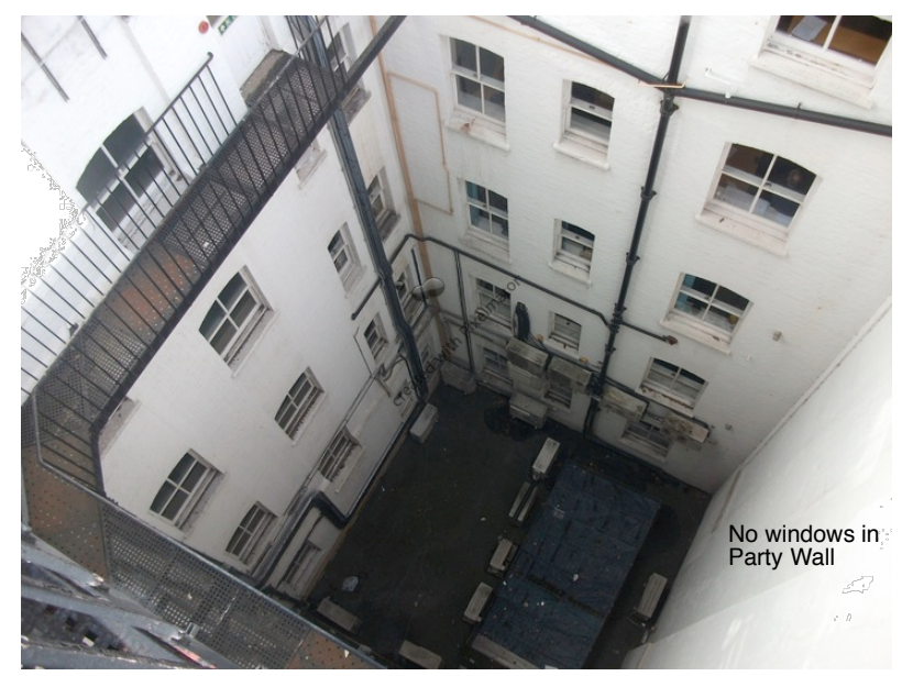
Redundant Utilities within lightwell