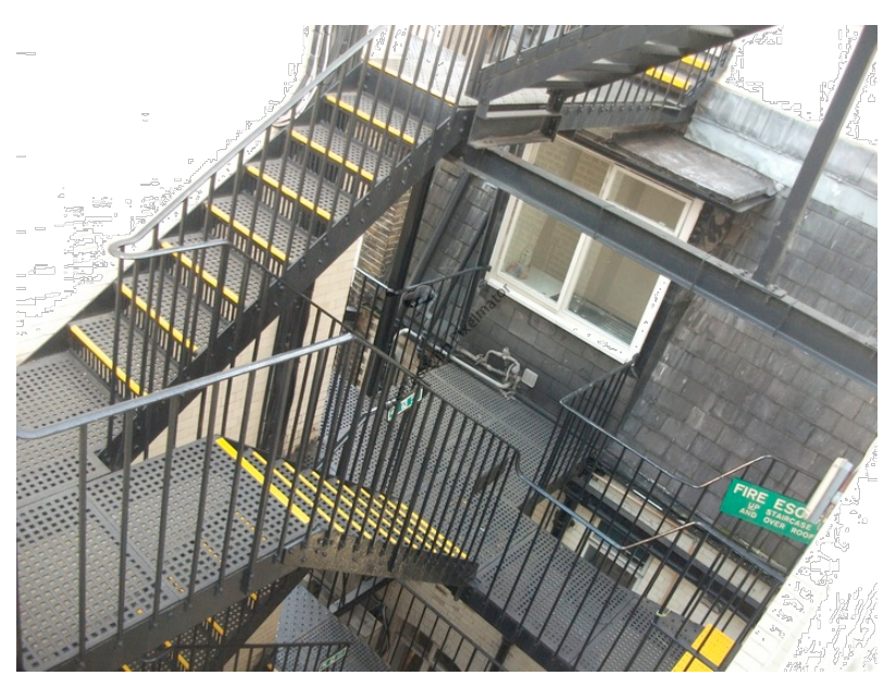
Lightwell with Part Fire escape stairs Redundant Utilities within lightwell