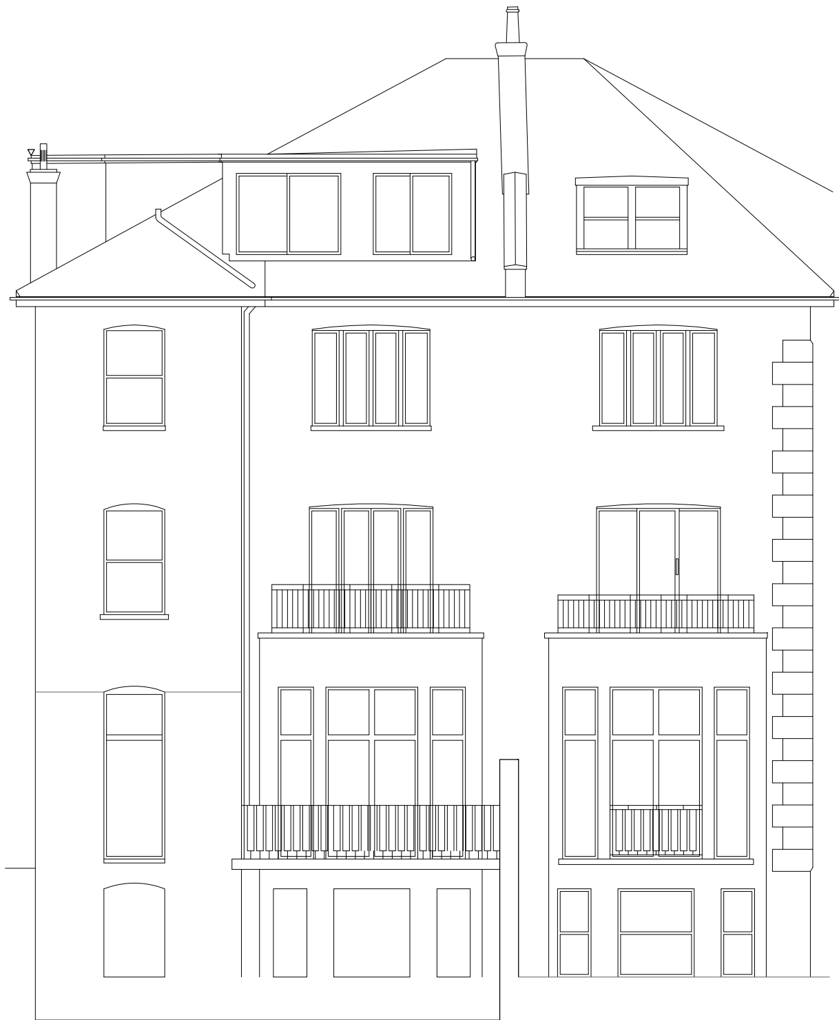
1 REAR ELEVATION - EXISTING 1:50 @ A1 / 1:100 @ A3