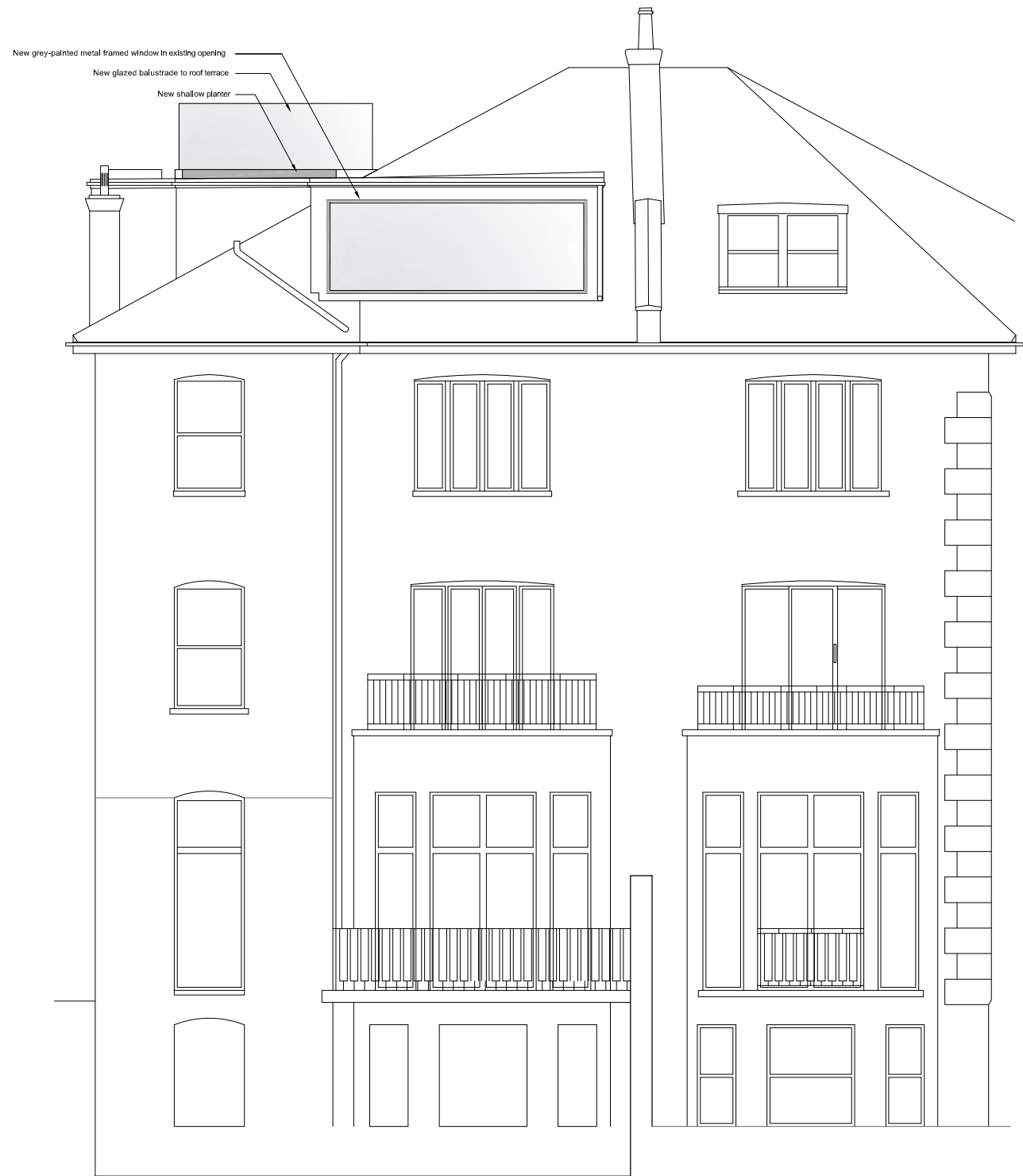
2 REAR ELEVATION - PROPOSED 1:50 @ A1 / 1:100 @ A3

NOTES: ALL RIGHTS DESCRIBED IN CHAPTER IV OF THE COPYRIGHT AND PATENTS ACT 1988 HAVE BEEN GENERALLY ASSERTED REPORT ANY DRAWING INCONSISTENCIES TO THE ARCHITECT DO NOT SCALE - ALL DIMENSIONS TO BE CHECKED ON SITE