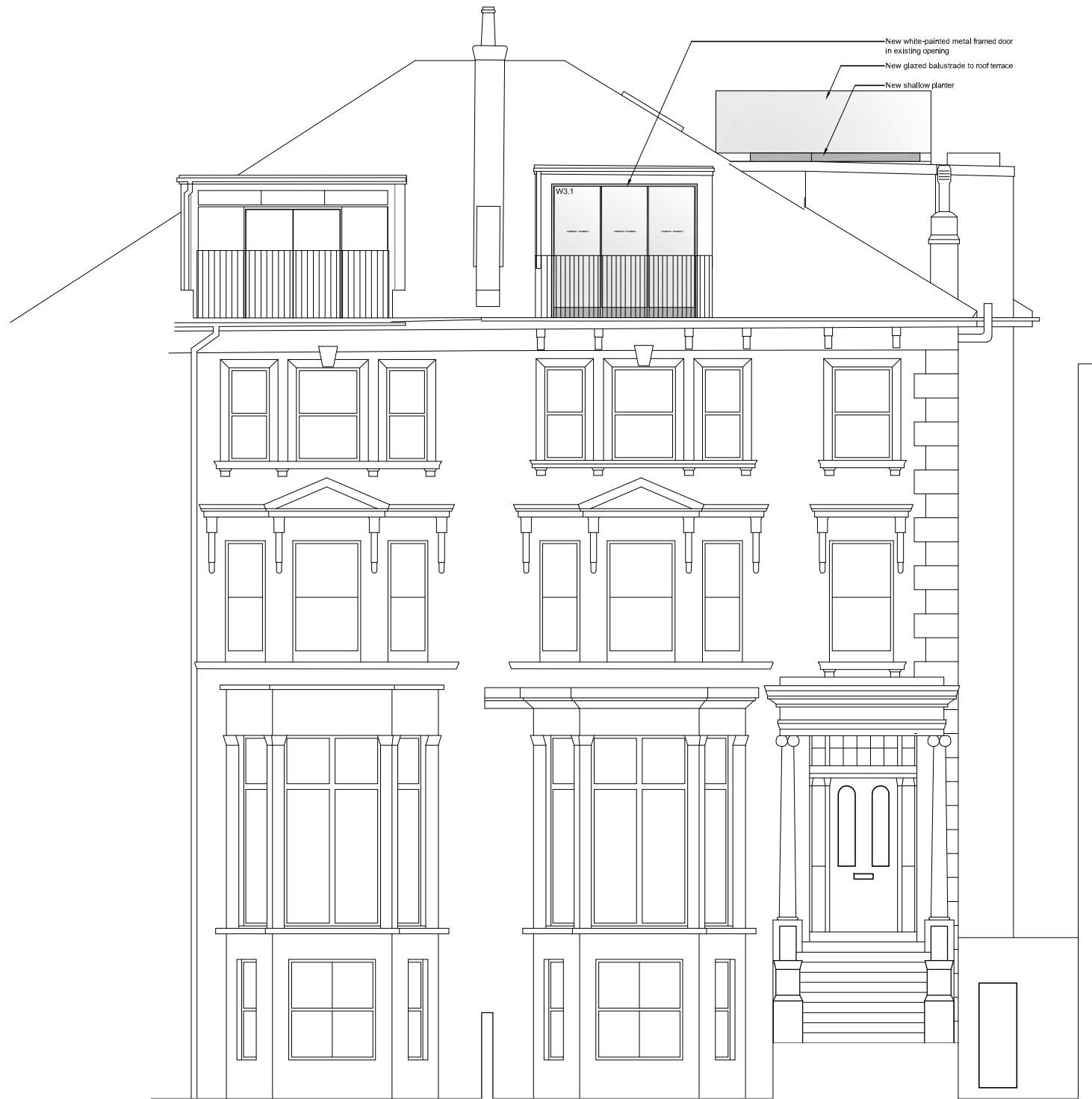
2 FRONT ELEVATION - PROPOSED 1:50 @ A1 / 1:100 @ A3

NOTES: ALL RIGHTS DESCRIBED IN CHAPTER IV OF THE COPYRIGHT AND PATENTS ACT 1988 HAVE BEEN GENERALLY ASSERTED REPORT ANY DRAWING INCONSISTENCIES TO THE ARCHITECT DO NOT SCALE - ALL DIMENSIONS TO BE CHECKED ON SITE