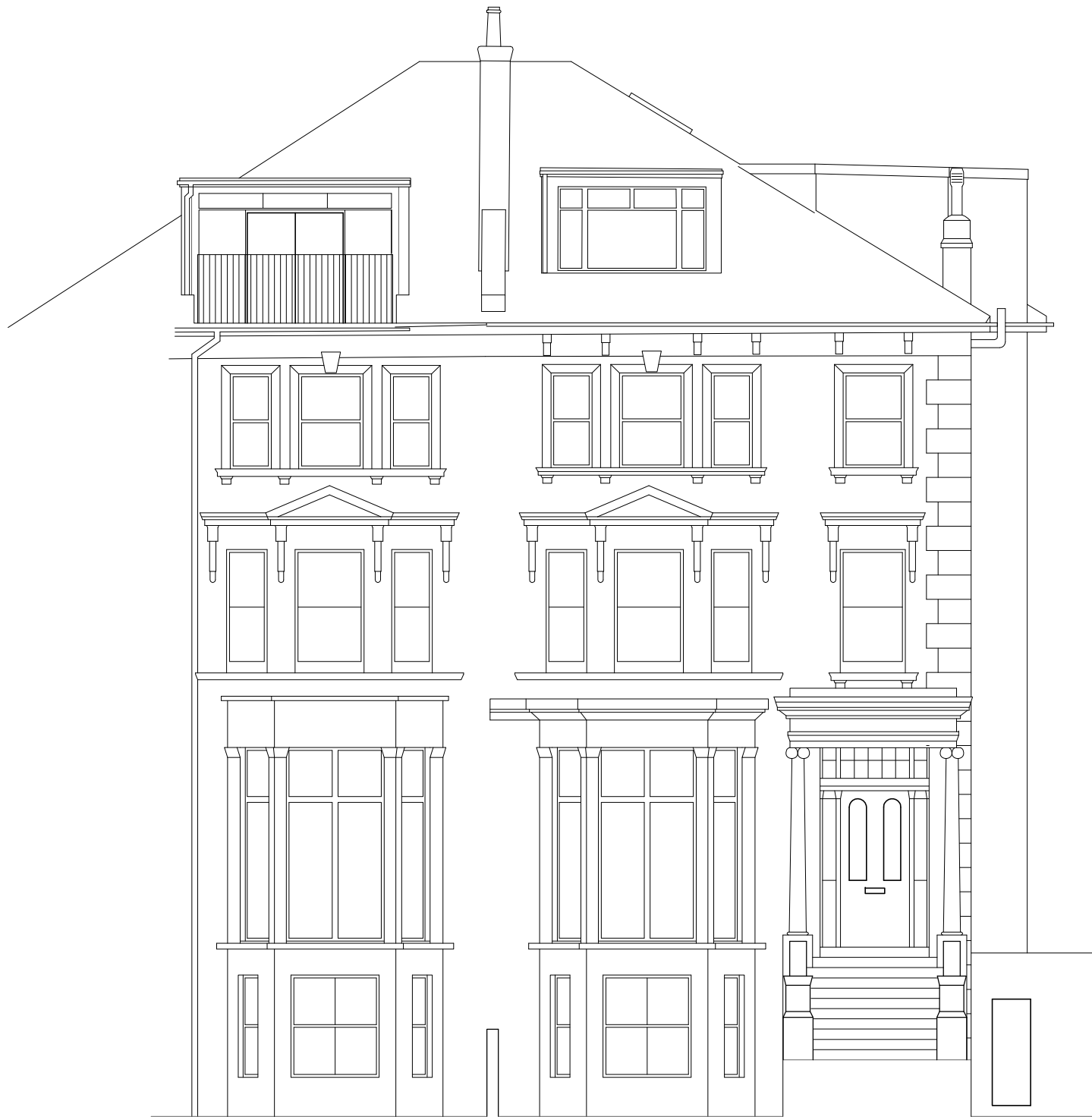
1 FRONT ELEVATION - EXISTING 1:50 @ A1 / 1:100 @ A3