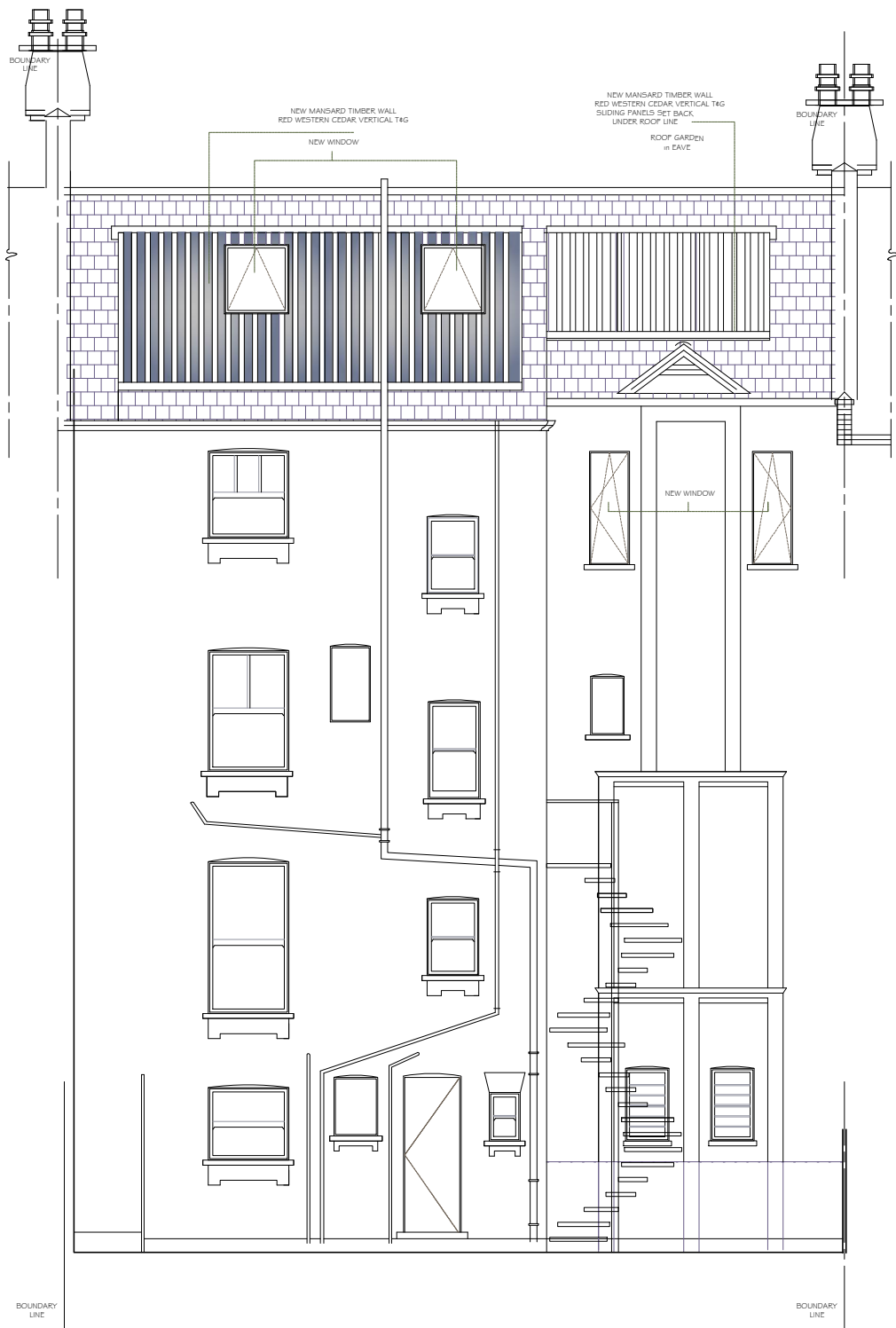
PROPOSED REAR ELEVATION WEST ELEVATION

Notes These drawings are strictly copyright and are not to be used, printed or copied in any form unless expressly permitted by ASB Architects. Any scale indicated on the drawing is only correct provided the drawing is printed at the original "Sheet Size" field. This is typically A1 or A3, printed without reduction, @ 100% This drawing may include information shown in colour as indicated by the "Printing" field. If the drawing is received incorrectly please refer to the sender or Architects. Do not scale from these drawings. Refer to figured dimensions only and, where these are missing or cannot be inferred from the given dimensions, refer to the Architect for instruction. Inform the Architect as soon as possible of any discrepancies found on site. This drawing is to be read in conjunction with the structural engineers' drawings, all other layout and detail drawings together with the Schedule of Works and Specification.