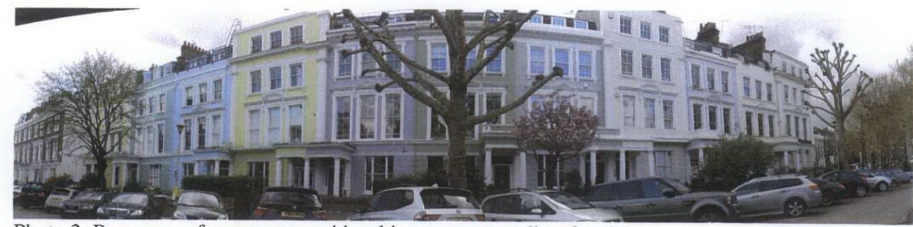
Photo 2: Panorama of street scene with subject property to lhs of main tree.