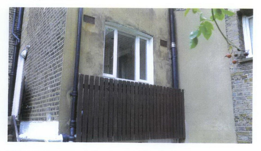
Photo 6: Existing window to be replaced with door leading to new wrought iron deck and stairs.