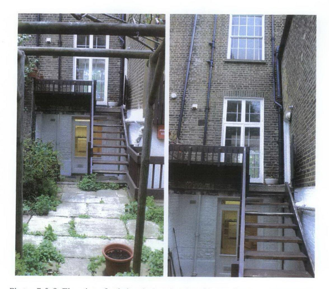
Photos 7 & 8: Elevation of existing deck and stairs with rear doors and transoms at ground floor level to be replaced.