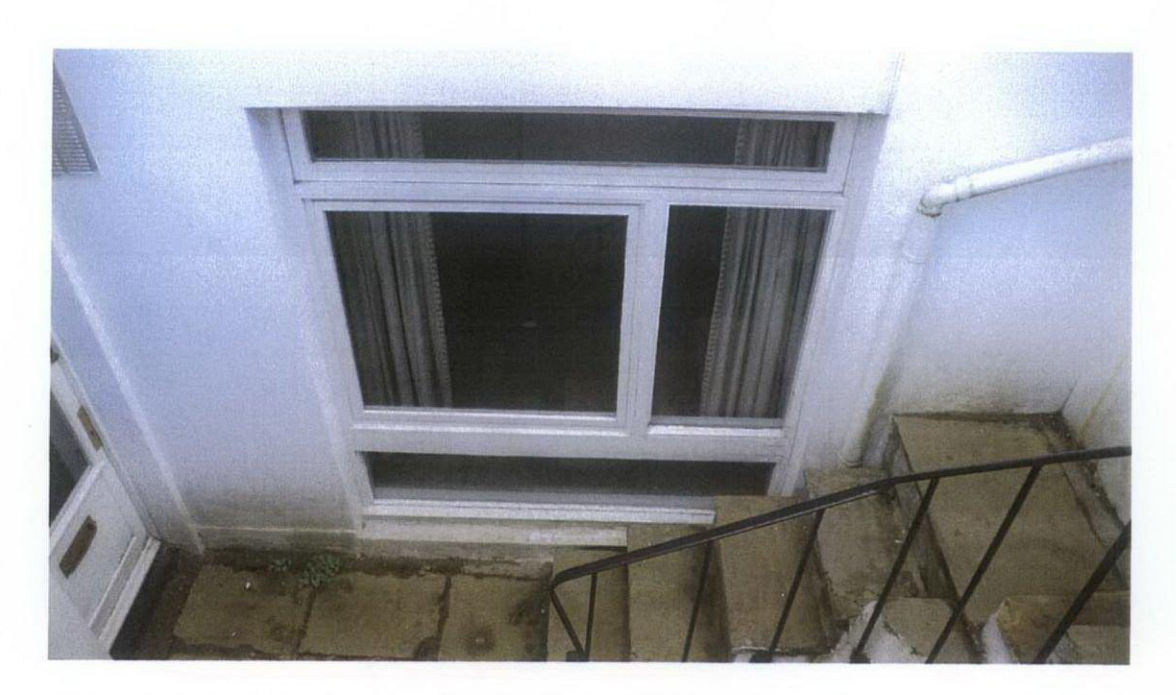
Photo 11: View from front garden to existing window to be replaced in proposed staff bedroom.