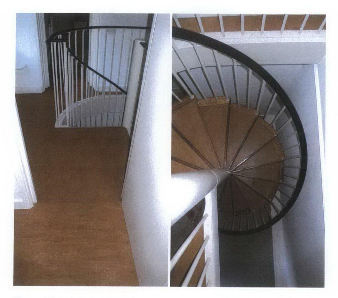
Photos 4 & 5: Spiral staircase from ground floor rear addition leading to dead space on lower ground floor.