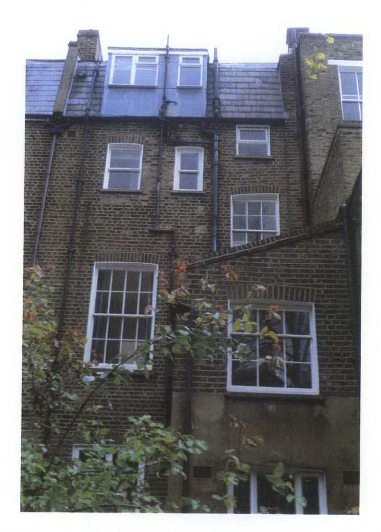
Photo 3: Existing rear elevation illustrating rear dormer to be replaced with 2 new dormer windows.