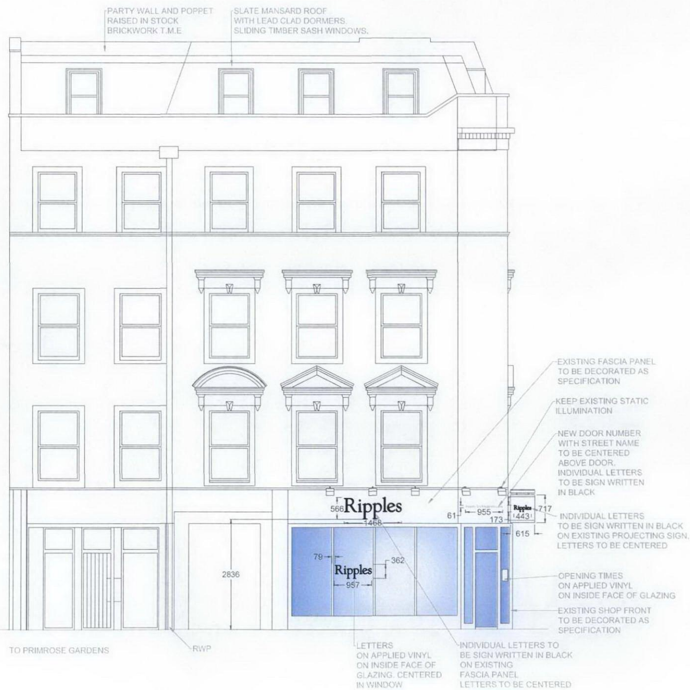
PROPOSED 1:50 SIDE ELEVATION