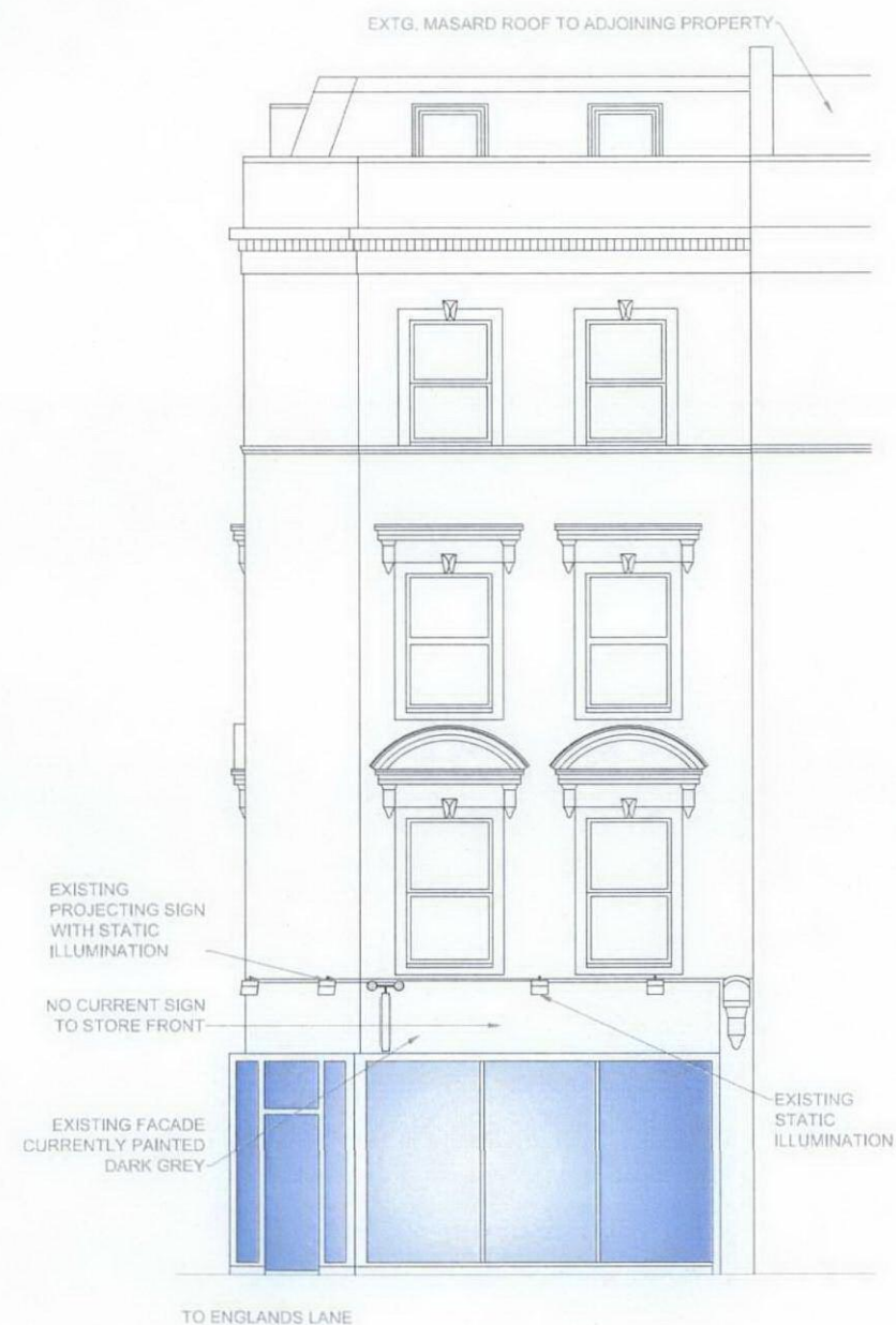
EXISTING 1:50 FRONT ELEVATION