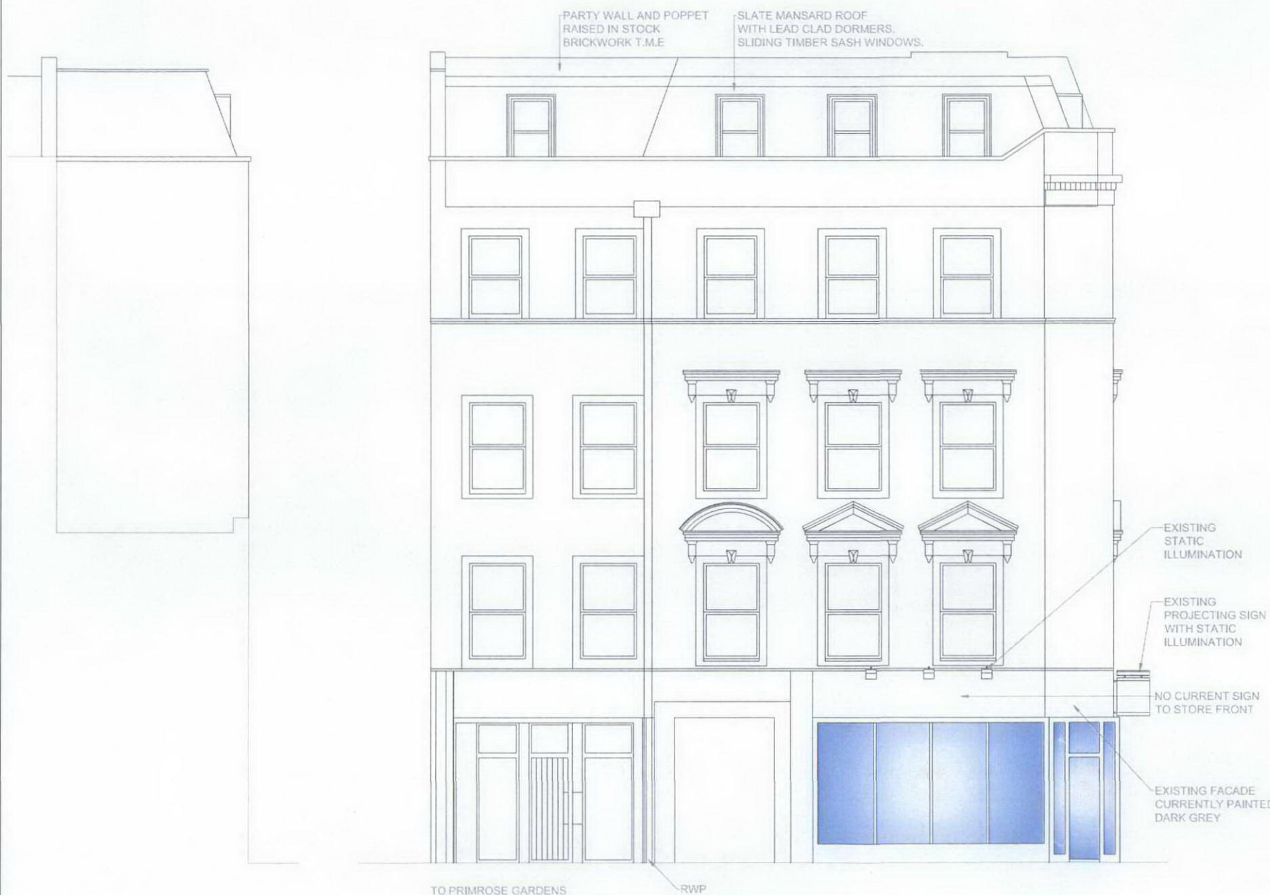
EXISTING 1:50 REAR ELEVATION