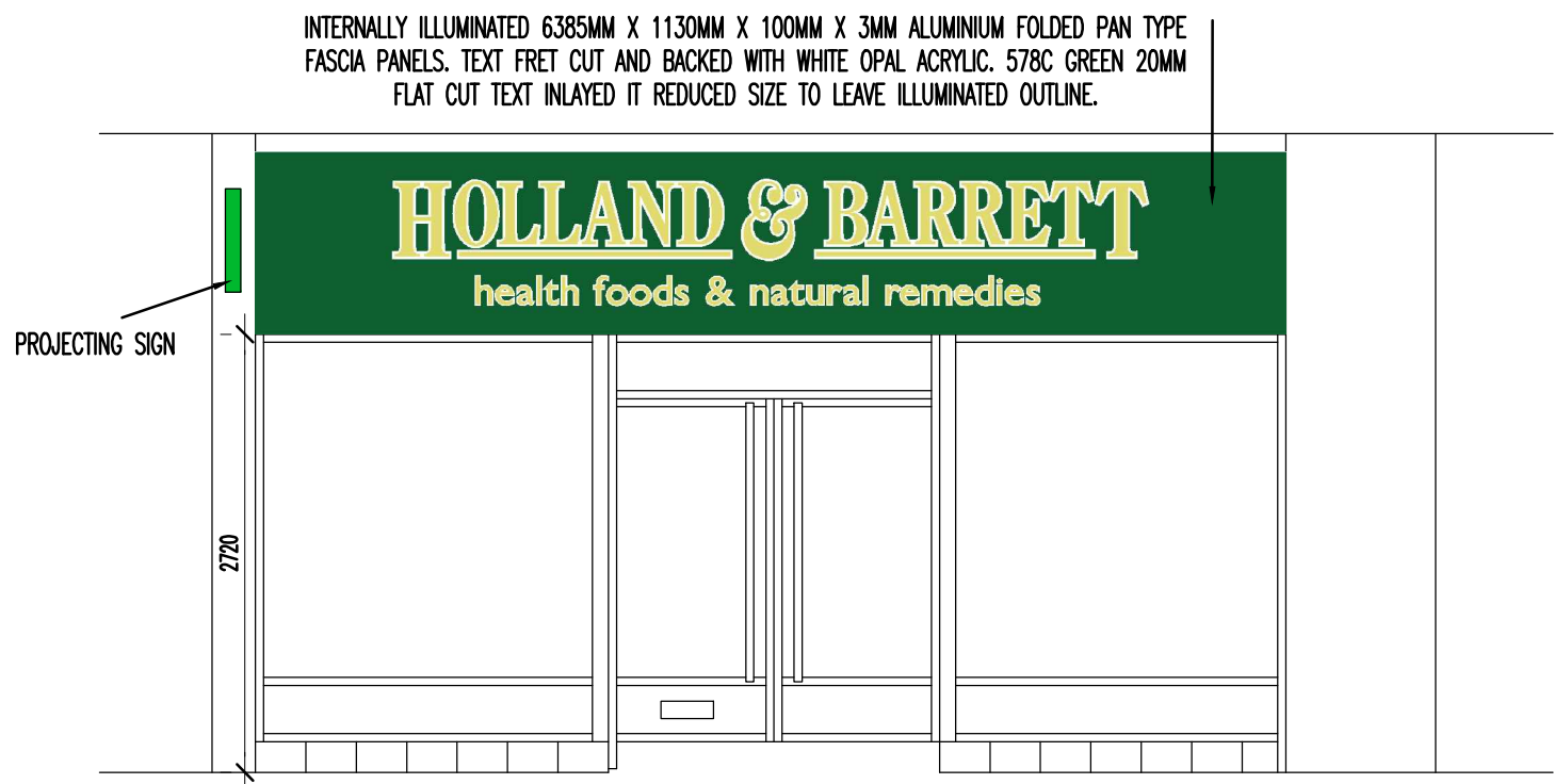
PROPOSED SHOP FRONT ELEVATION 1:50 @ A1