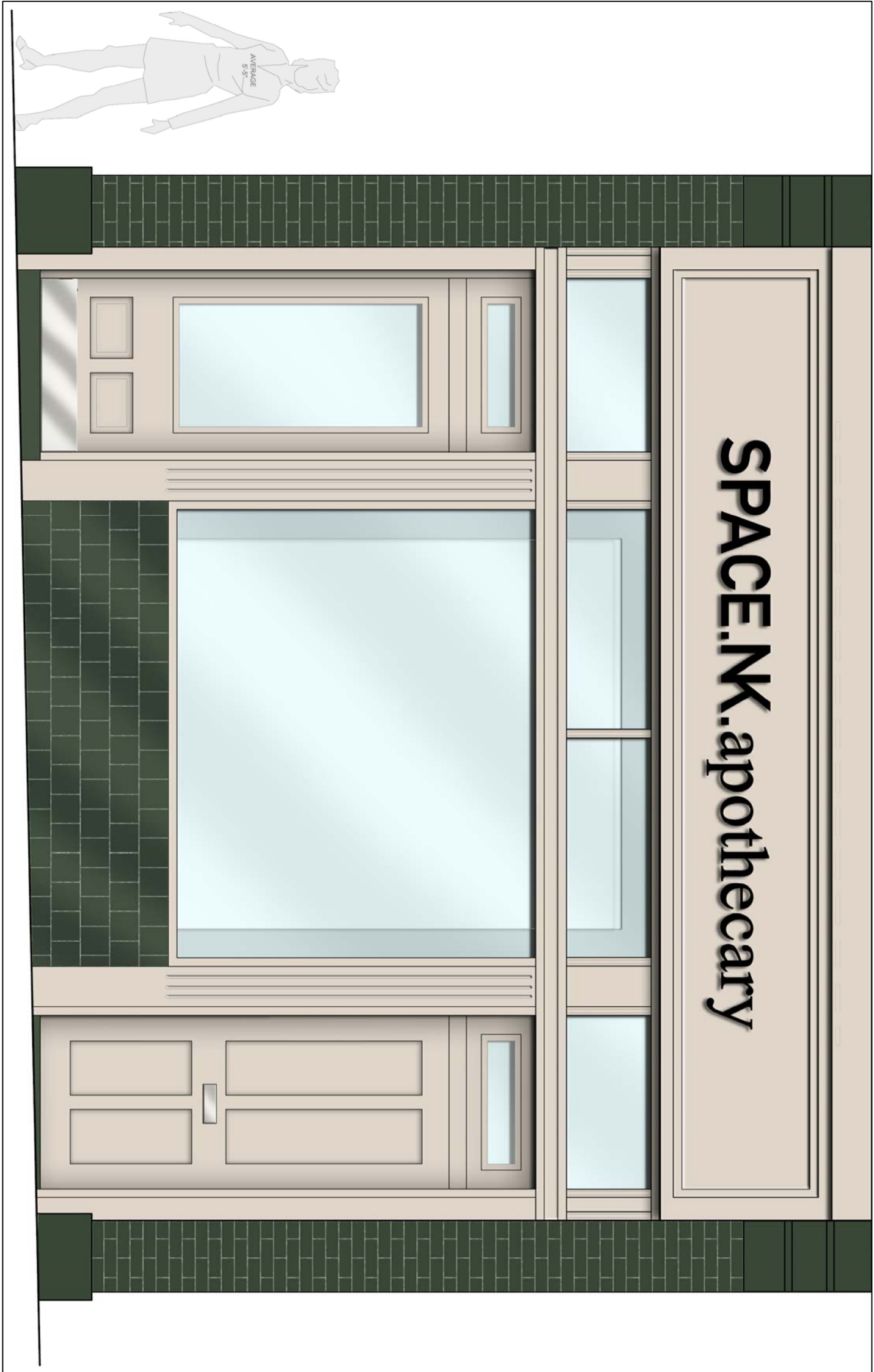
Proposed Shop Front Visual

This drawing remains the property of Design Time Ltd and is issued on the condition that it's not disclosed or copied in part or whole to any unauthorised person without prior consent of Design Time Ltd.