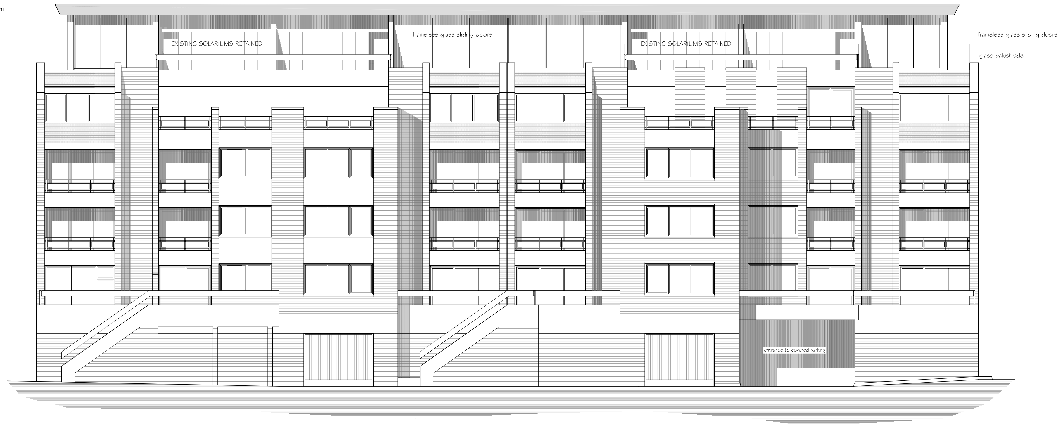
WEST ELEVATION TO GARDEN