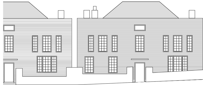
1 Existing Street Elevation Scale 1:200