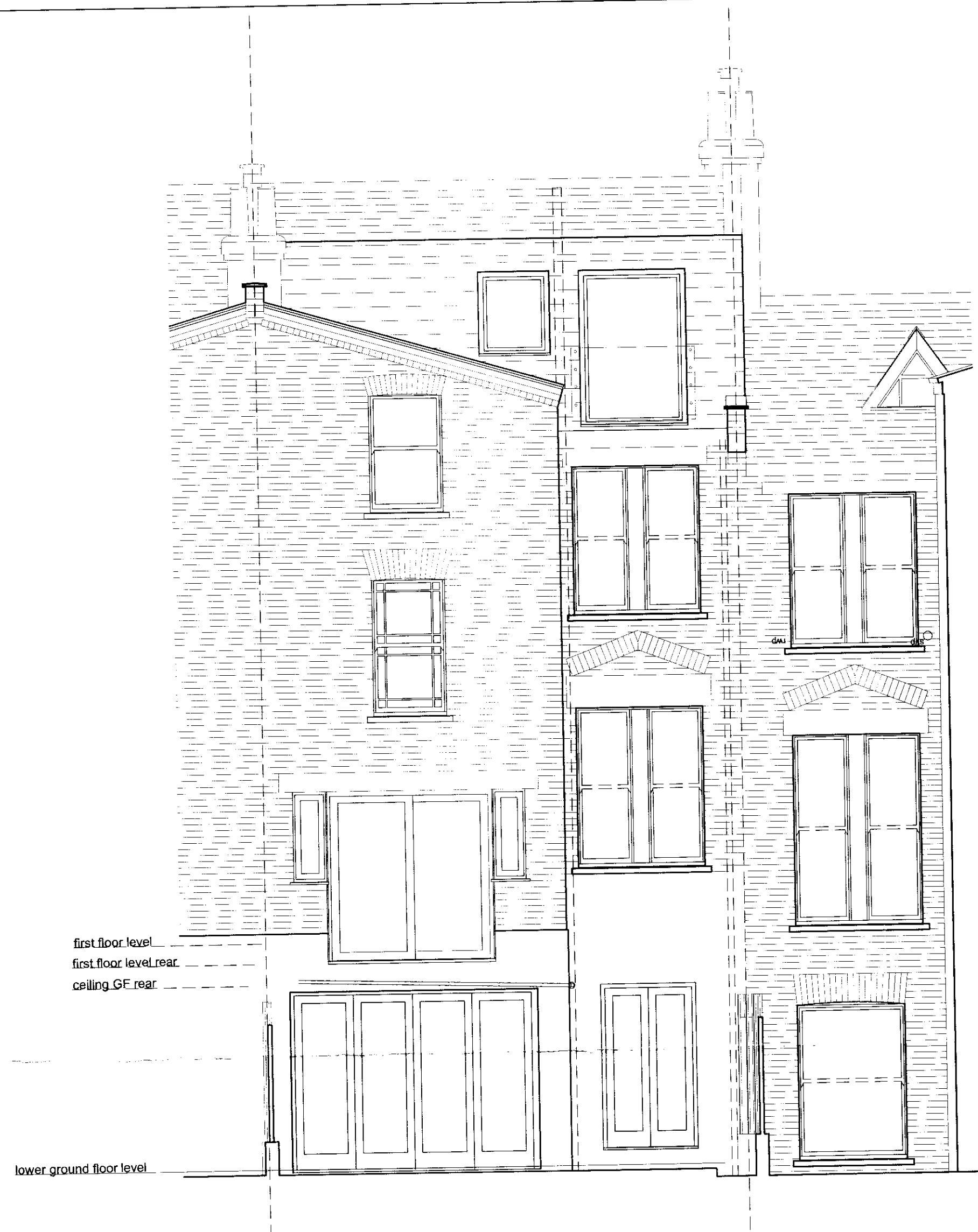
Existing Rear Elevation Northern Aspect