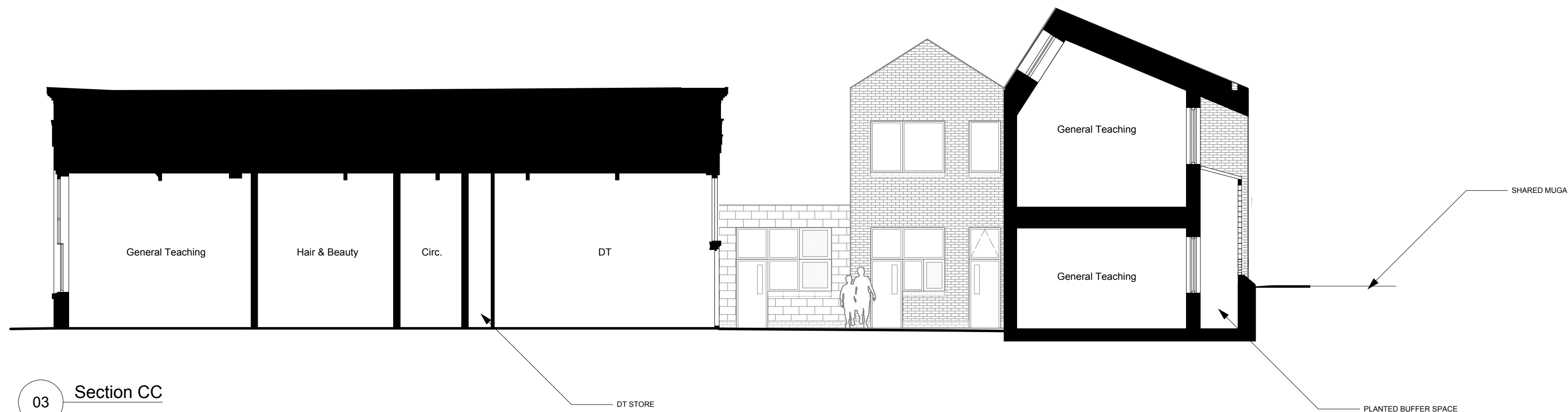
03 Section CC