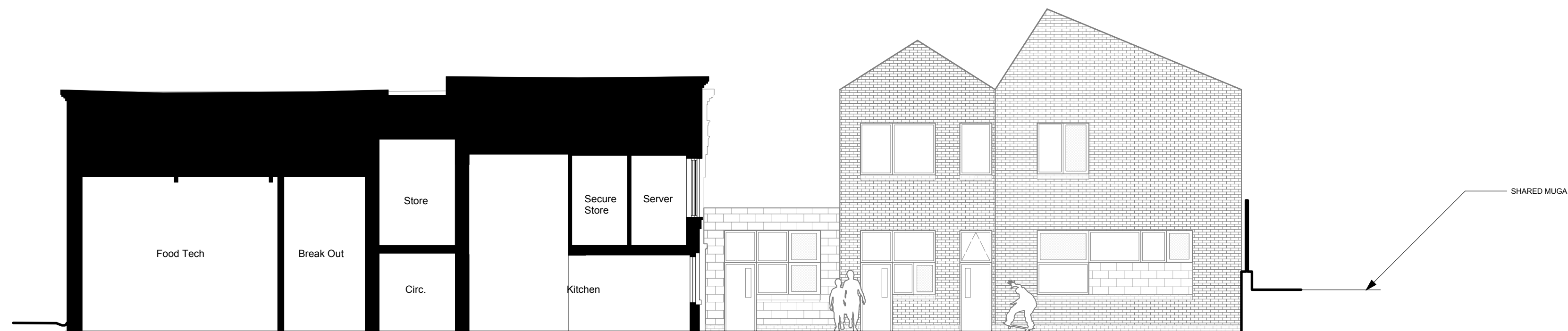
02 Section DD