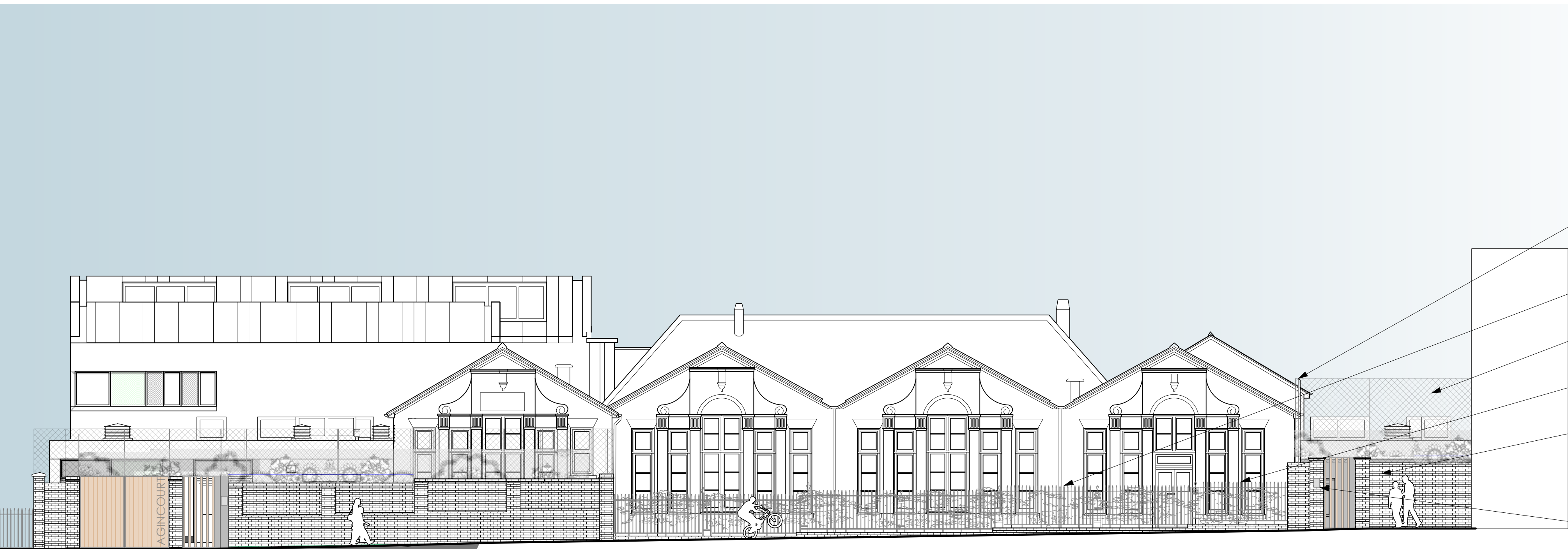
02 PROPOSED STREET ELEVATION AT AGINCOURT HOUSE NORTH