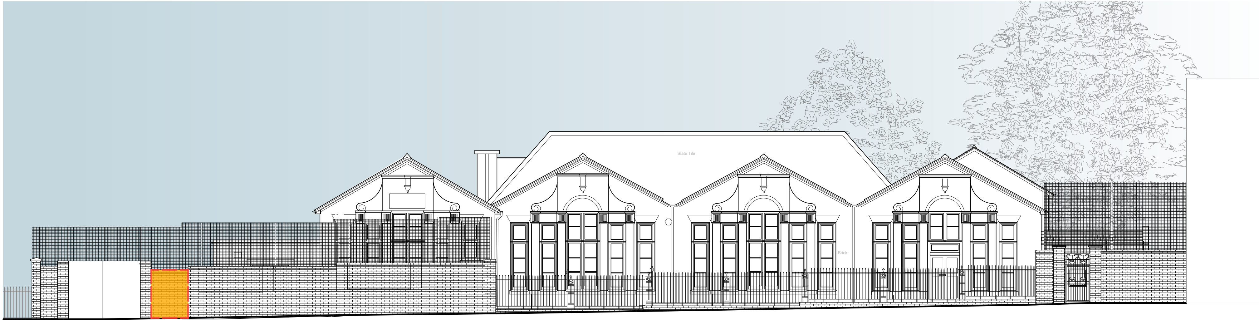
01 EXISTING STREET ELEVATION AT AGINCOURT HOUSE NORTH