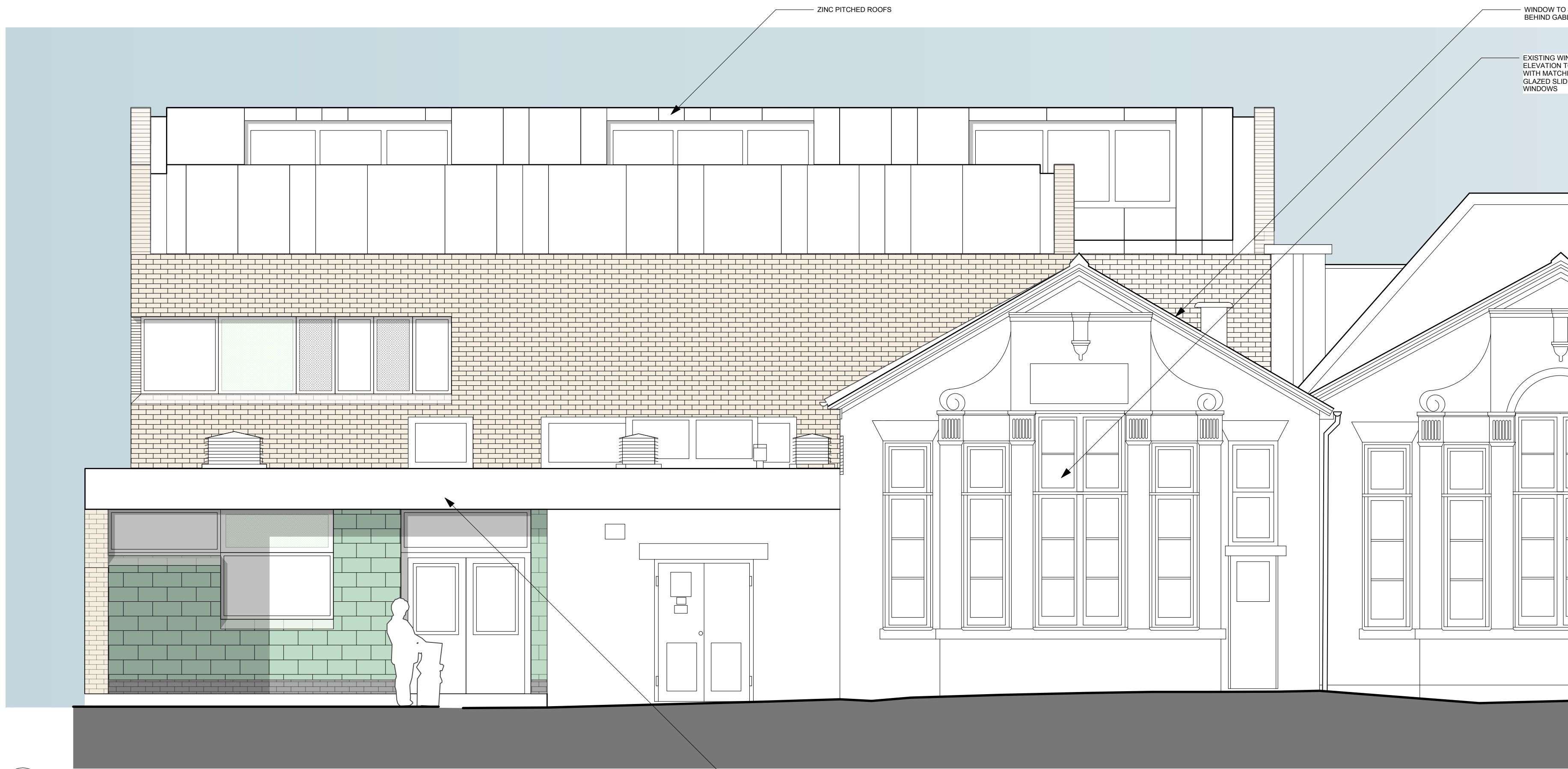
06 North Elevation