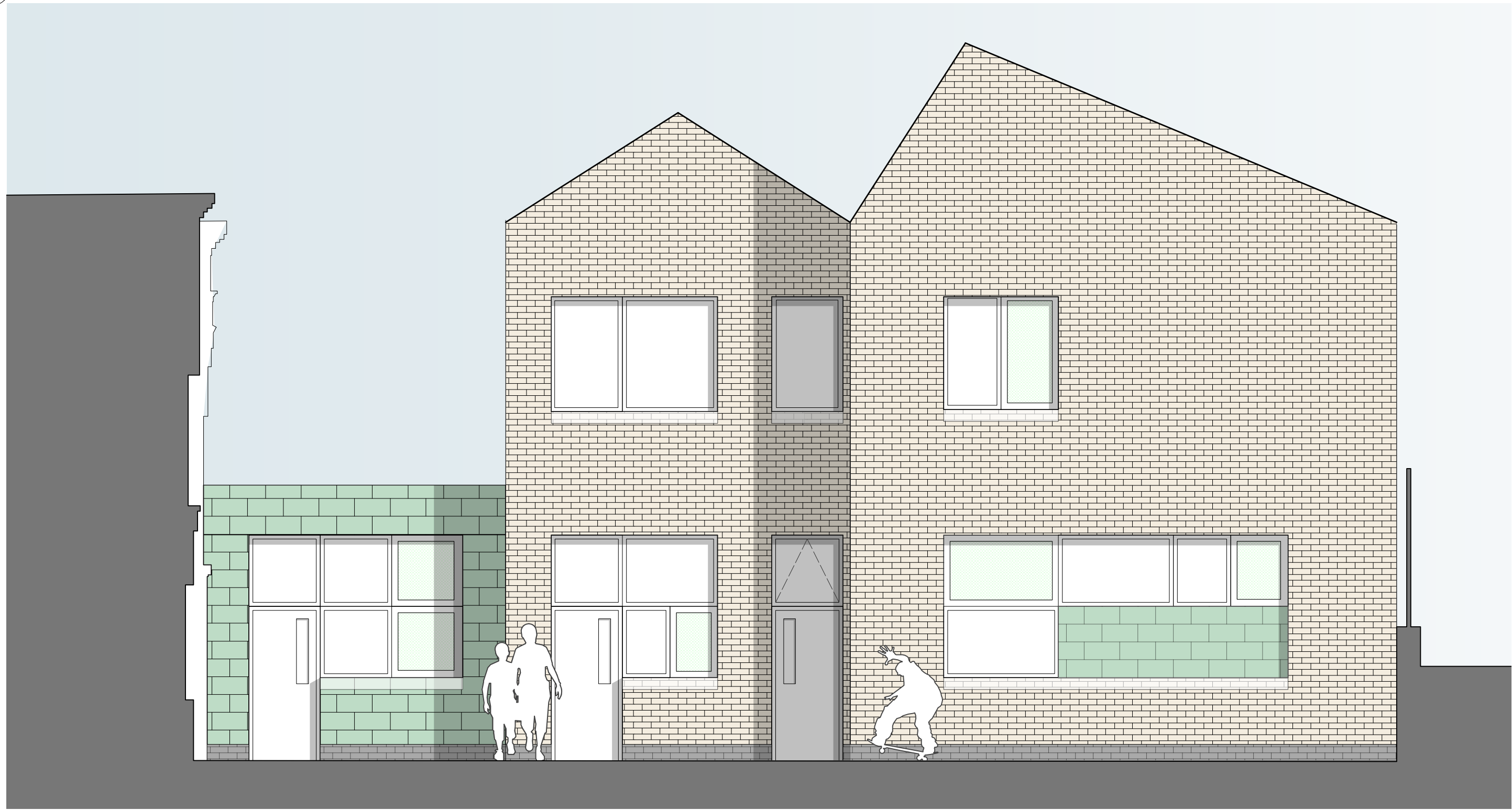
02 West 2 Elevation