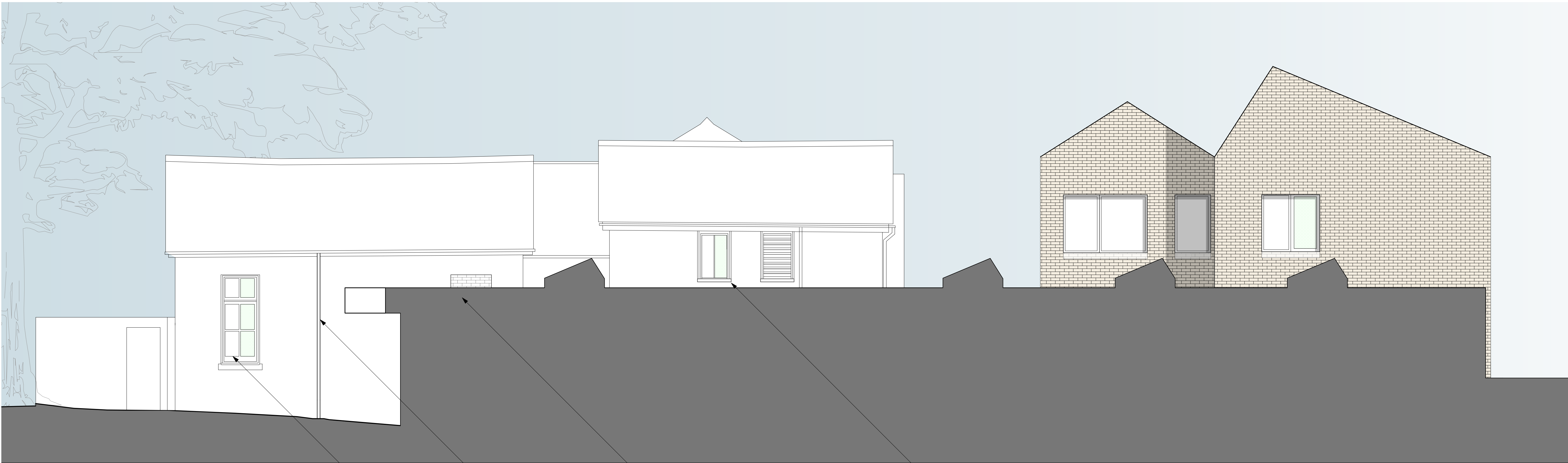
01 West Elevation

EXISTING WINDOWS TO BE REPLACED WITH ROBUST ALUMINIUM SLIDING WINDOW AS ON NEW BUILD