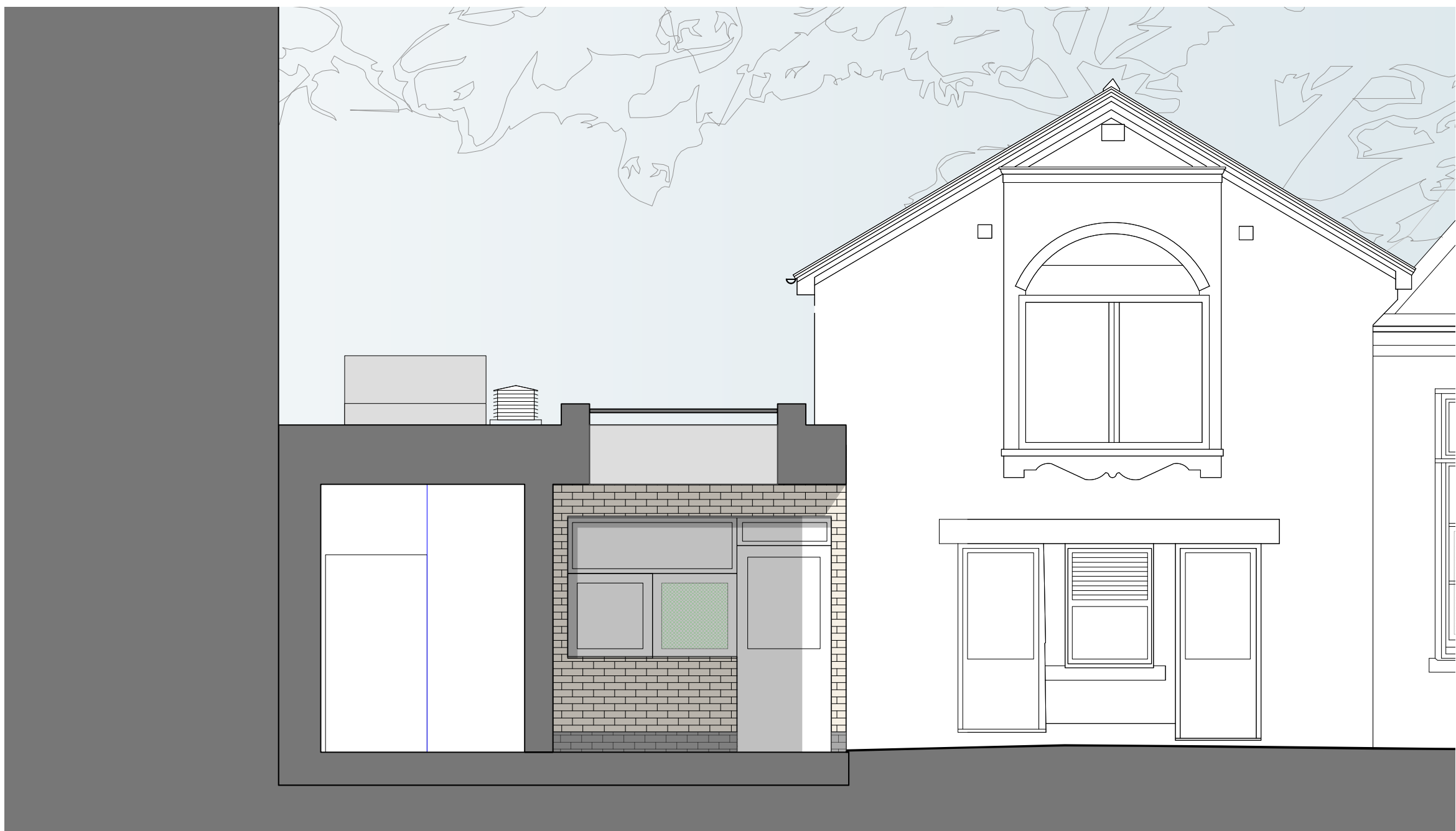
03 South 3 Elevation

EXISTING WINDOWS TO BE REPLACED WITH ROBUST ALUMINIUM SLIDING WINDOW AS ON NEW BUILD