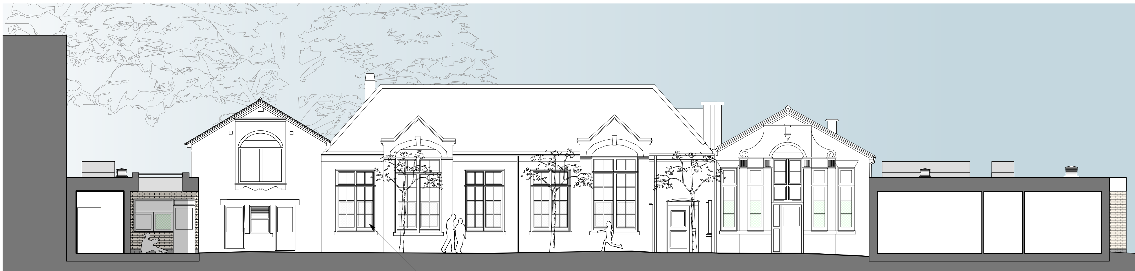
03 South 3 Elevation

EXISTING COURTYARD WINDOWS TO BE REPLACED WITH ROBUST ALUMINIUM SLIDING WINDOWS AS ON NEW BUILD BUT INKEEPING WITH DIMENSIONS OF ORIGINAL SECURITY MESH TO BE REMOVED.