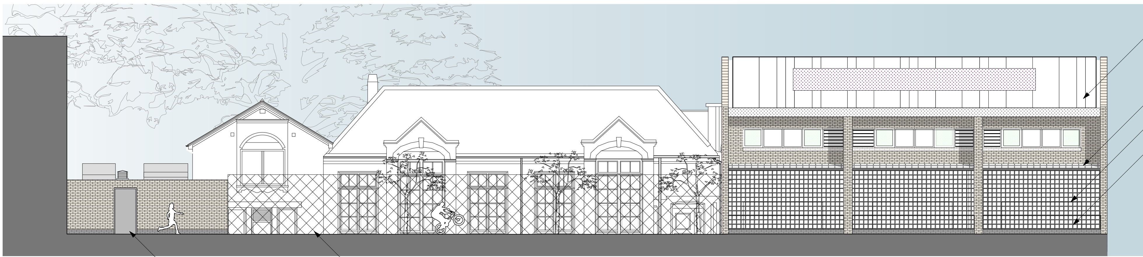
01 South Elevation