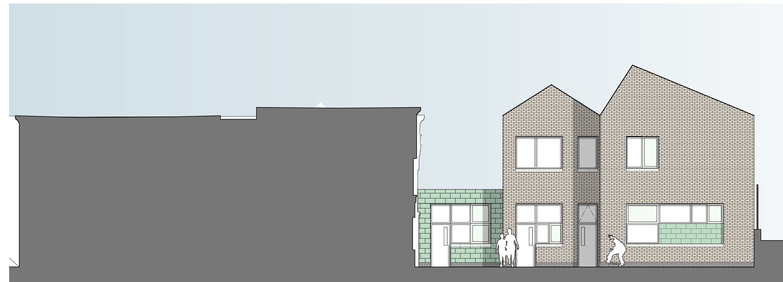
04 West 2 Elevation