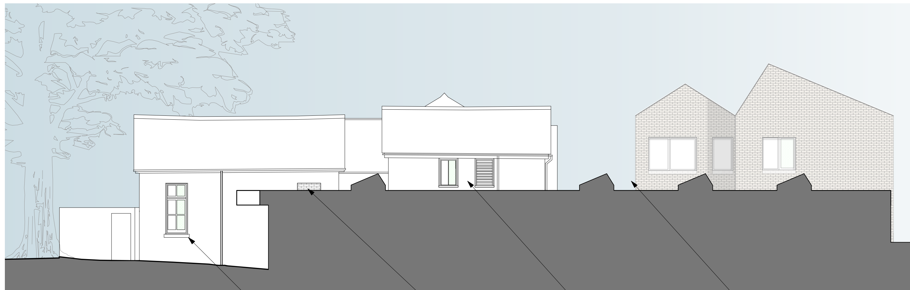
03 West Elevation