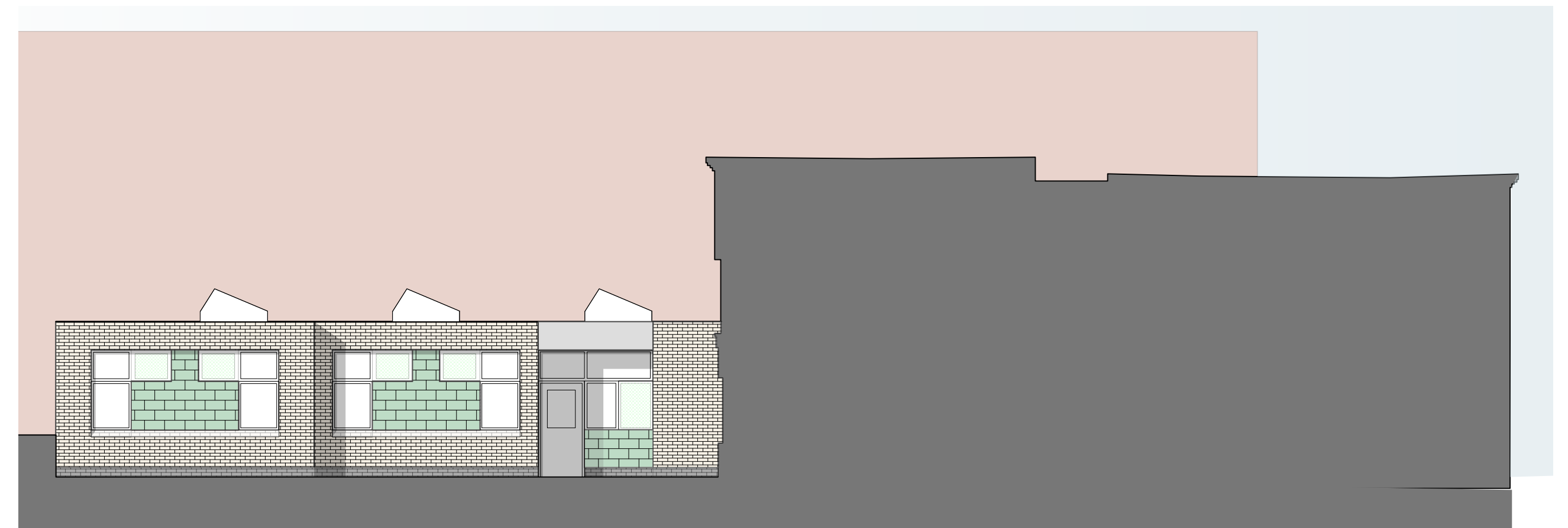
02 East 2 Elevation