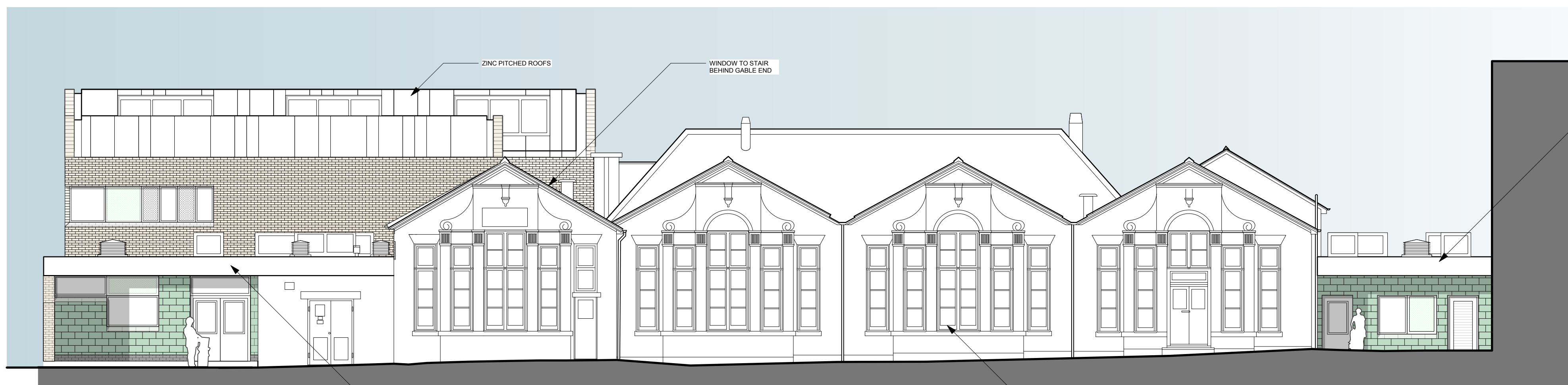
05 North Elevation