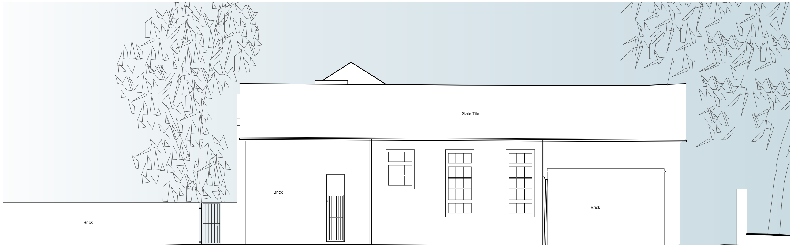
03 East Elevation