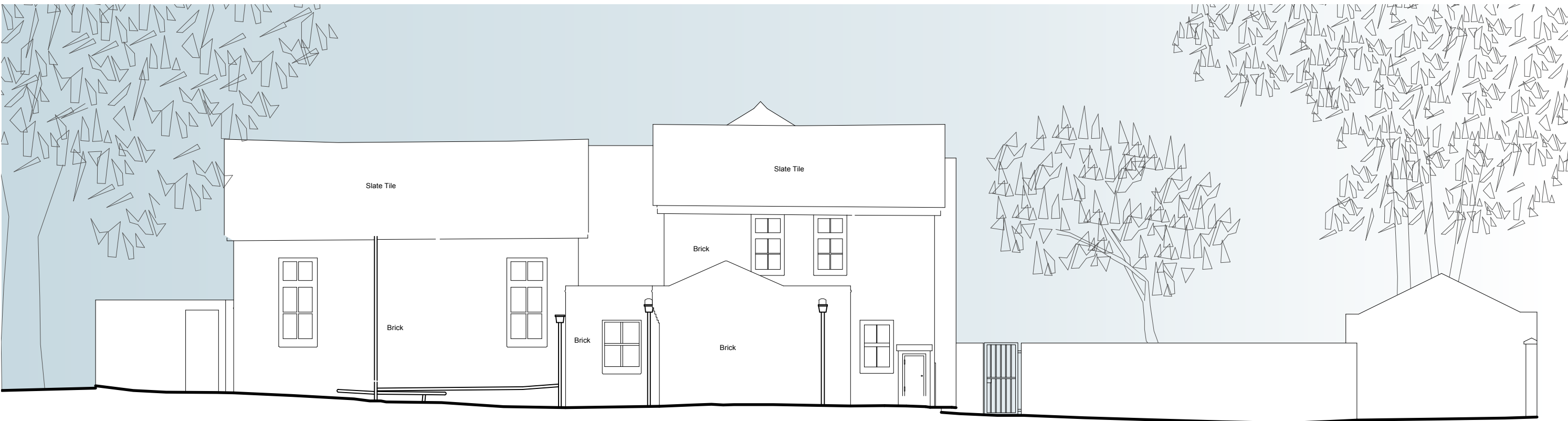
02 West Elevation