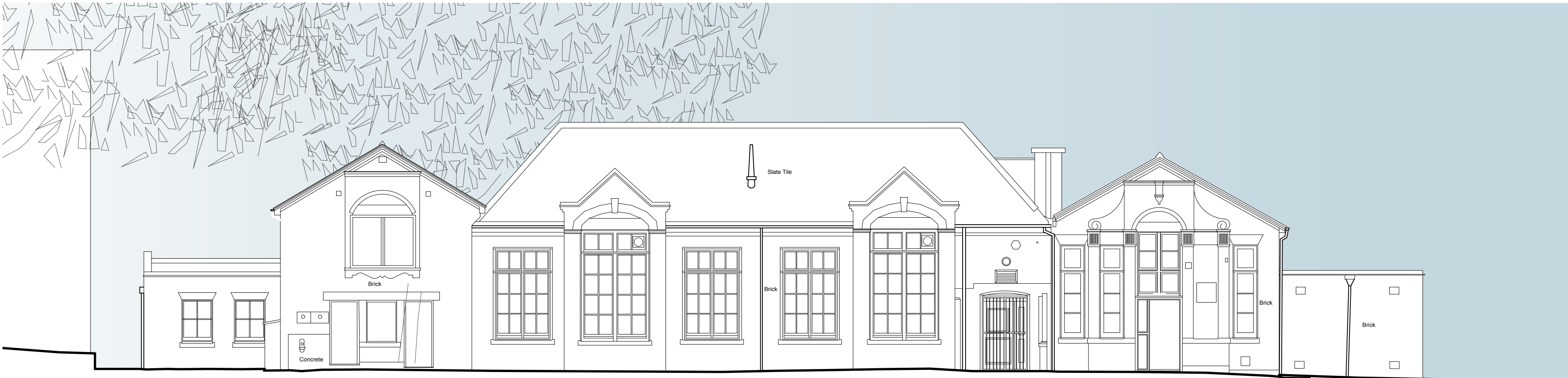
04 South Elevation