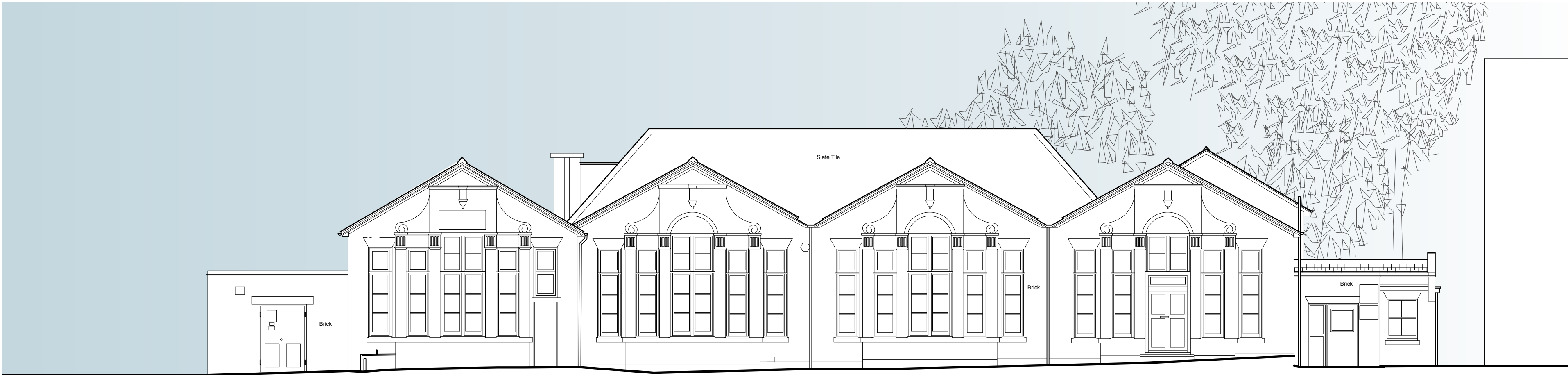
01 North Elevation