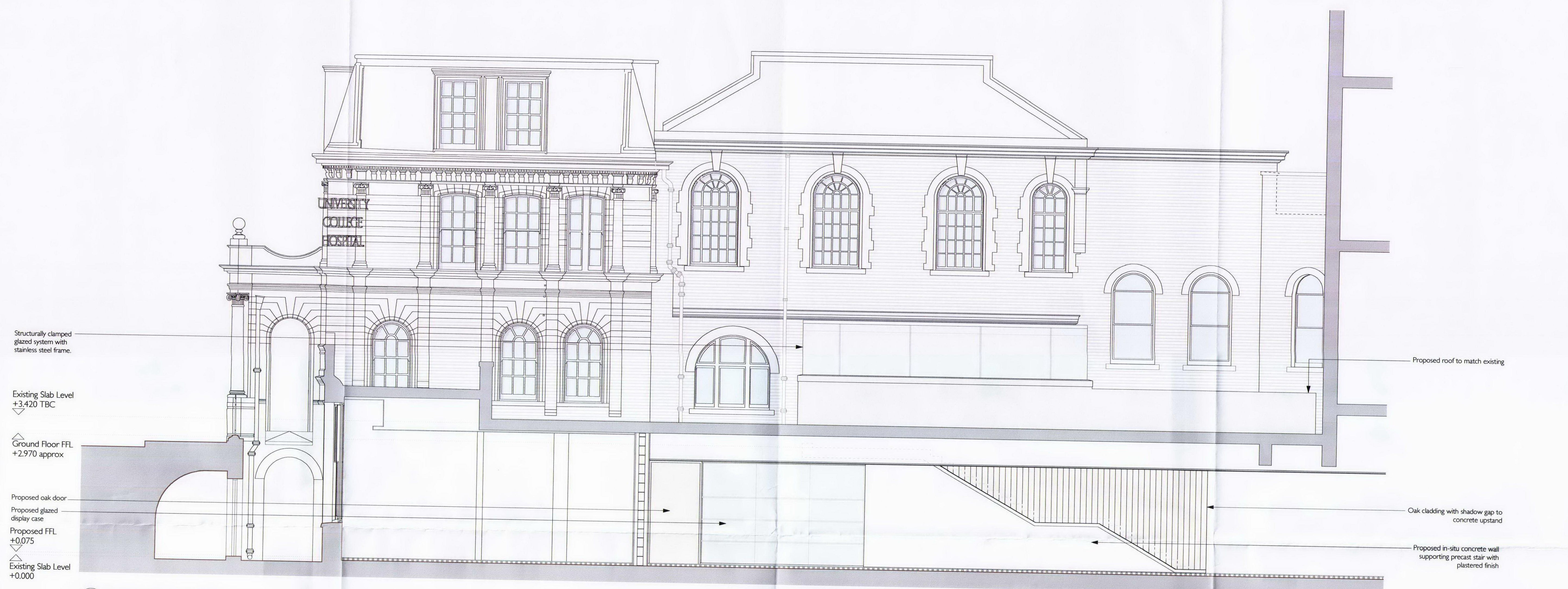
01 Proposed Entrance Hall External Elevation 1:50 @ A1, 1:100 @ A3