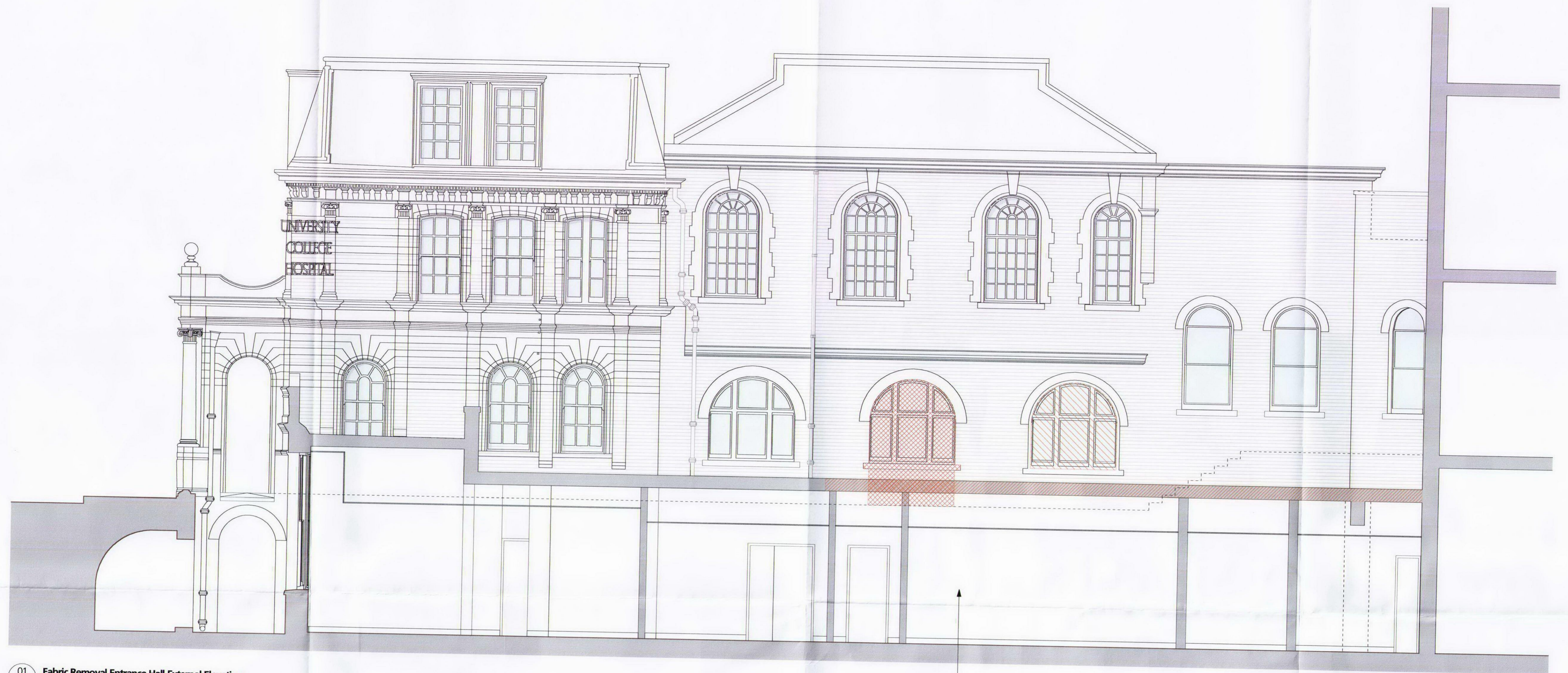
01 Fabric Removal Entrance Hall External Elevation 1:50 @ A1, 1:100 @ A3

Existing non original plasterboard walls to be removed