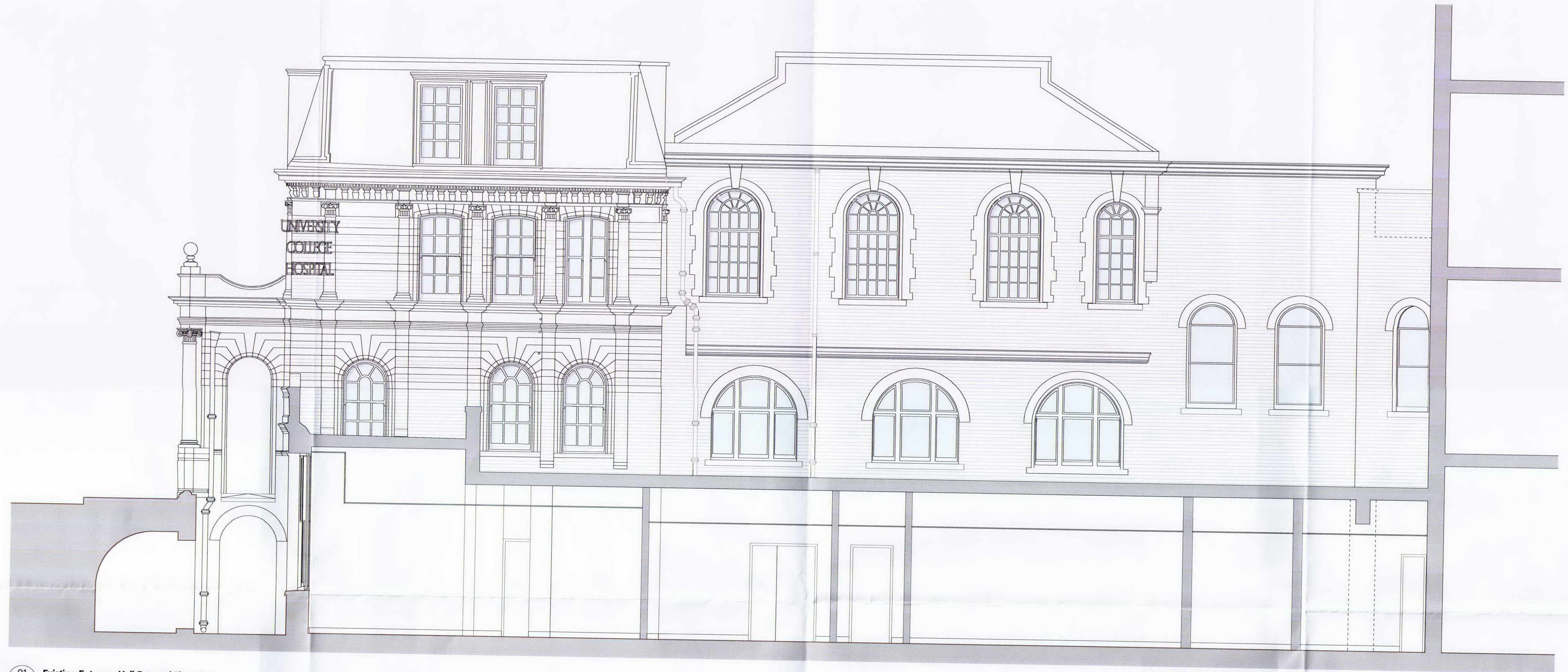
01 Existing Entrance Hall External Elevation 1:50 @ A1, 1:100 @ A3