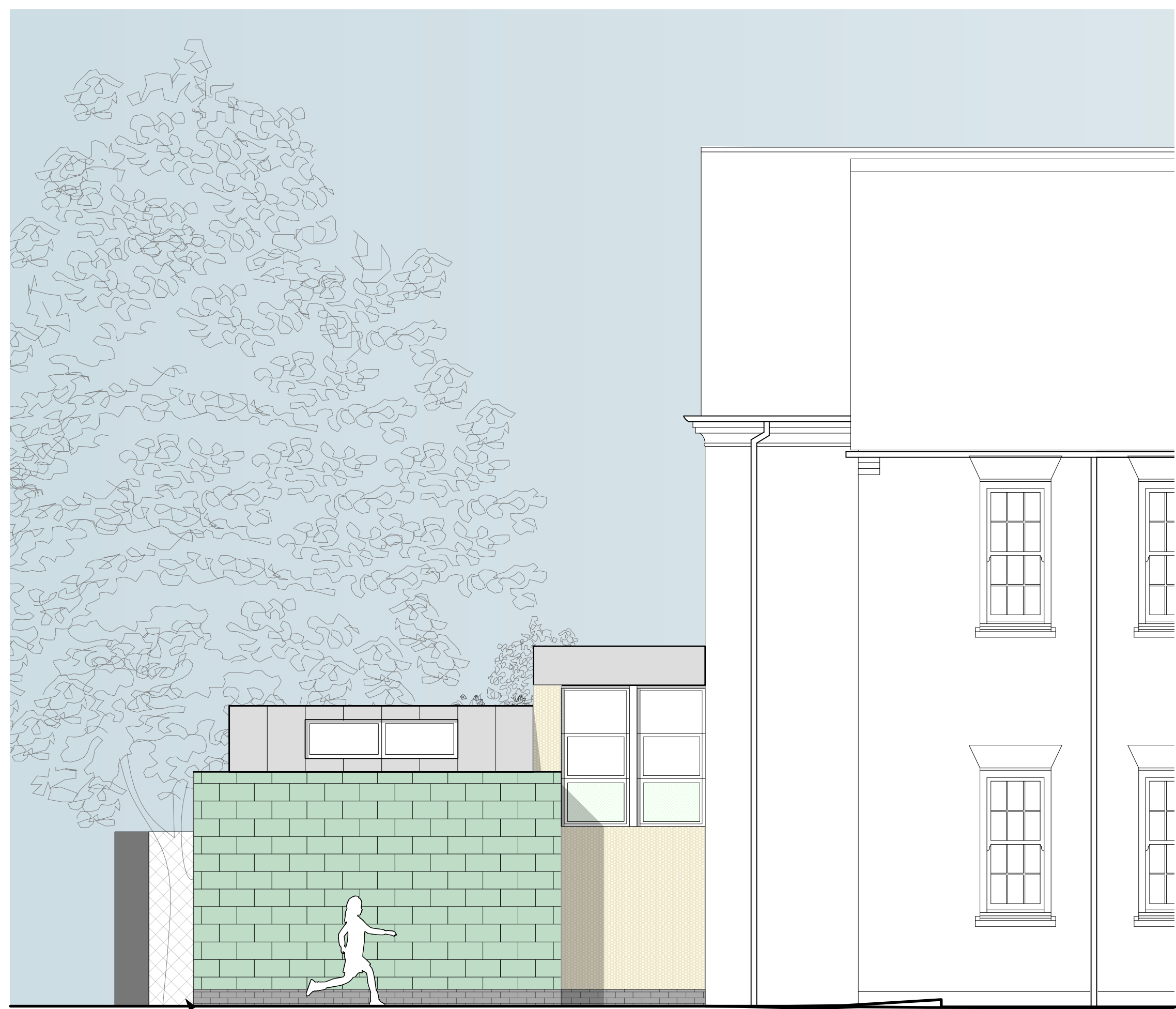
02 East Elevation

Main Entrance Door Door with Glazed Panel New Timber Gate Existing Boundary Wall