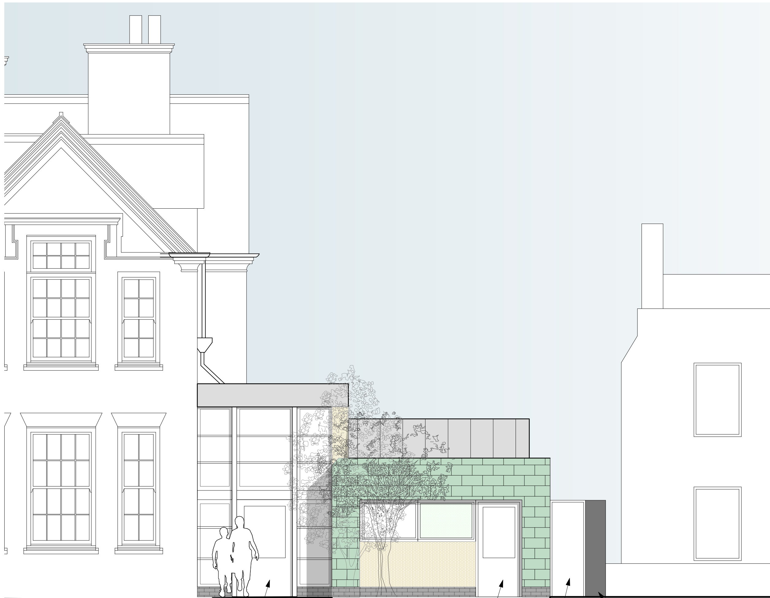
01 West Elevation

Main Entrance Door Door with Glazed Panel New Timber Gate Existing Boundary Wall