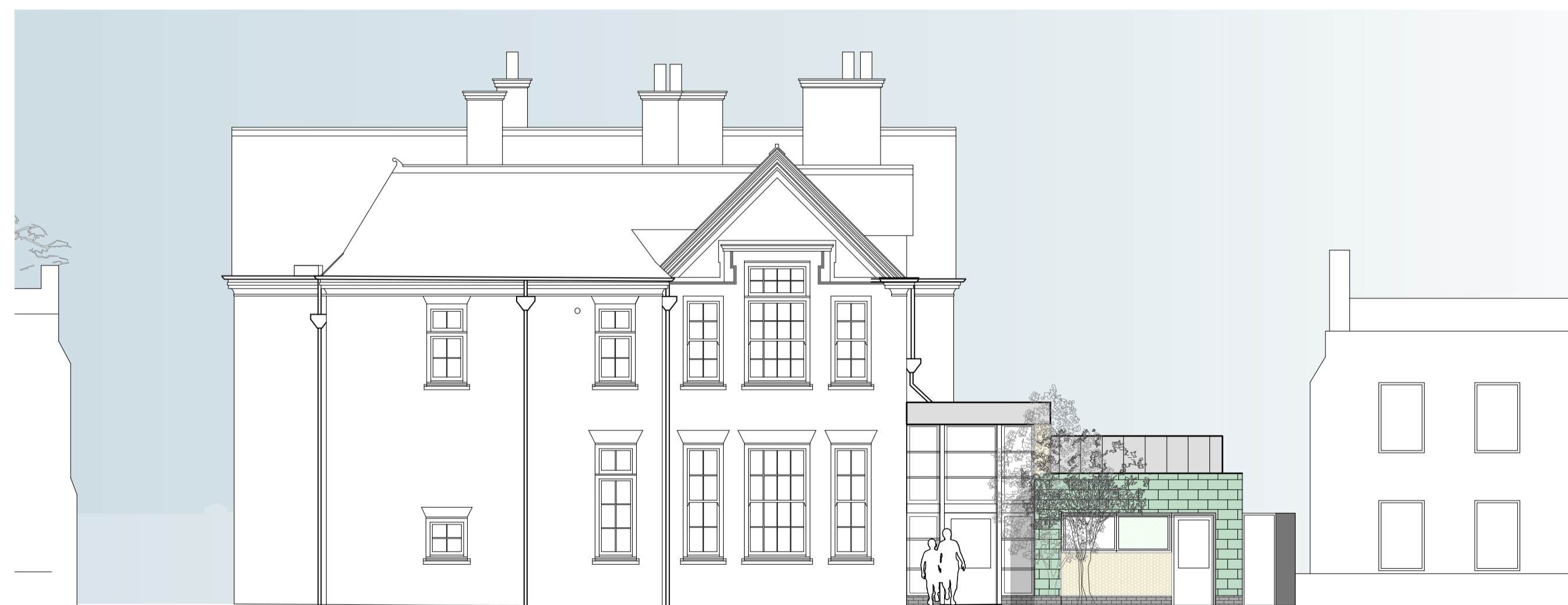
04 West Elevation