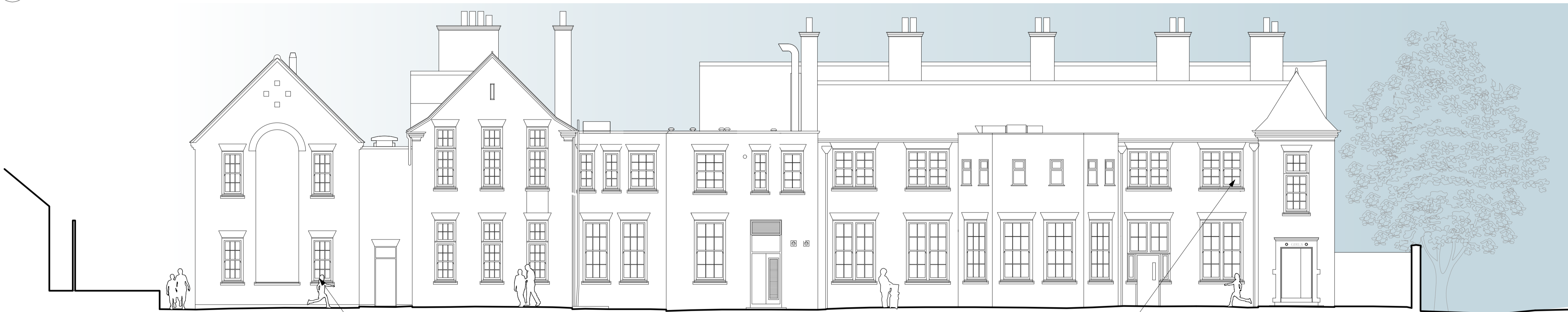
02 North Elevation