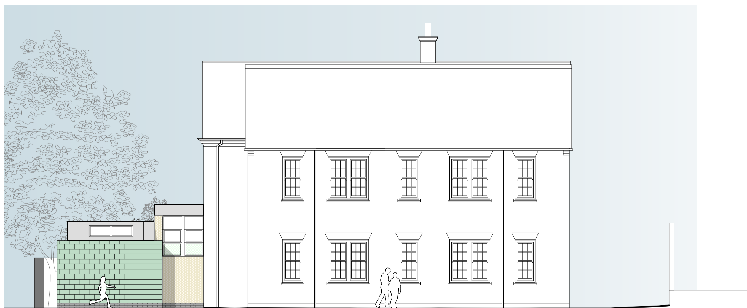
03 East Elevation