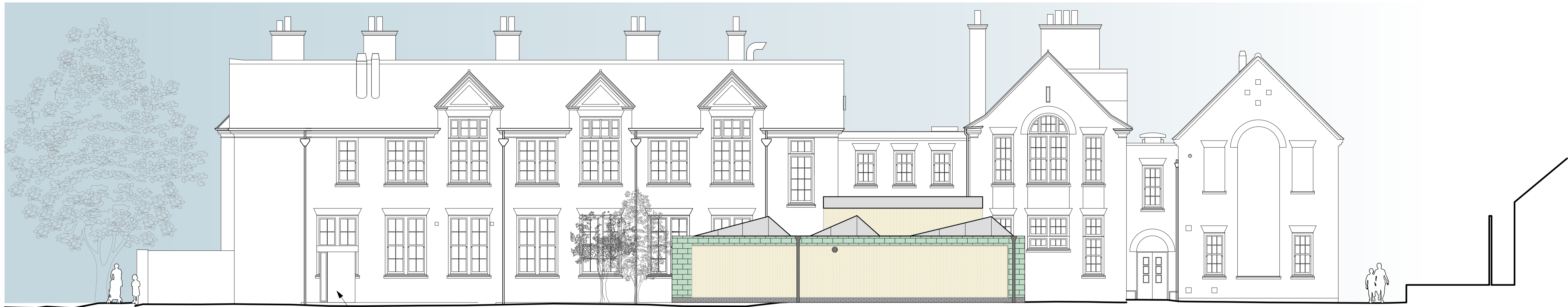
01 South Elevation