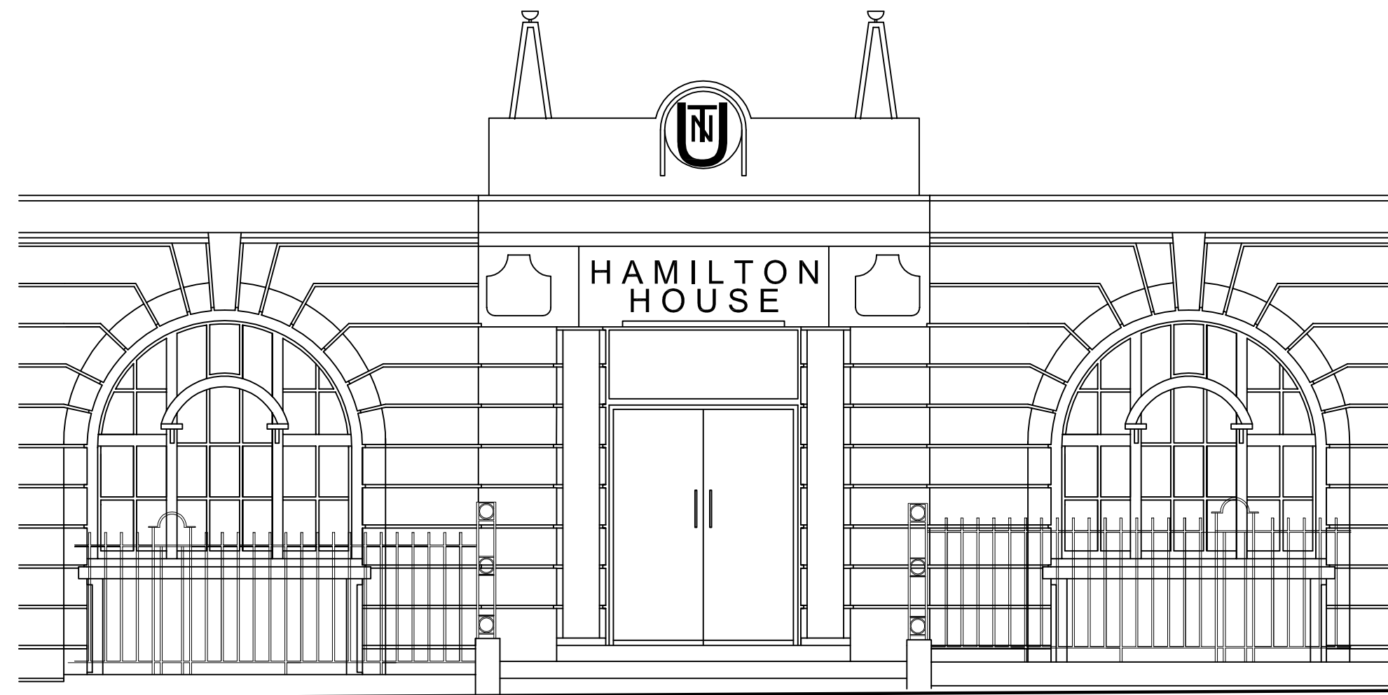
2 Front Door Detail - Mabledon Place - As Existing Scale 1:50