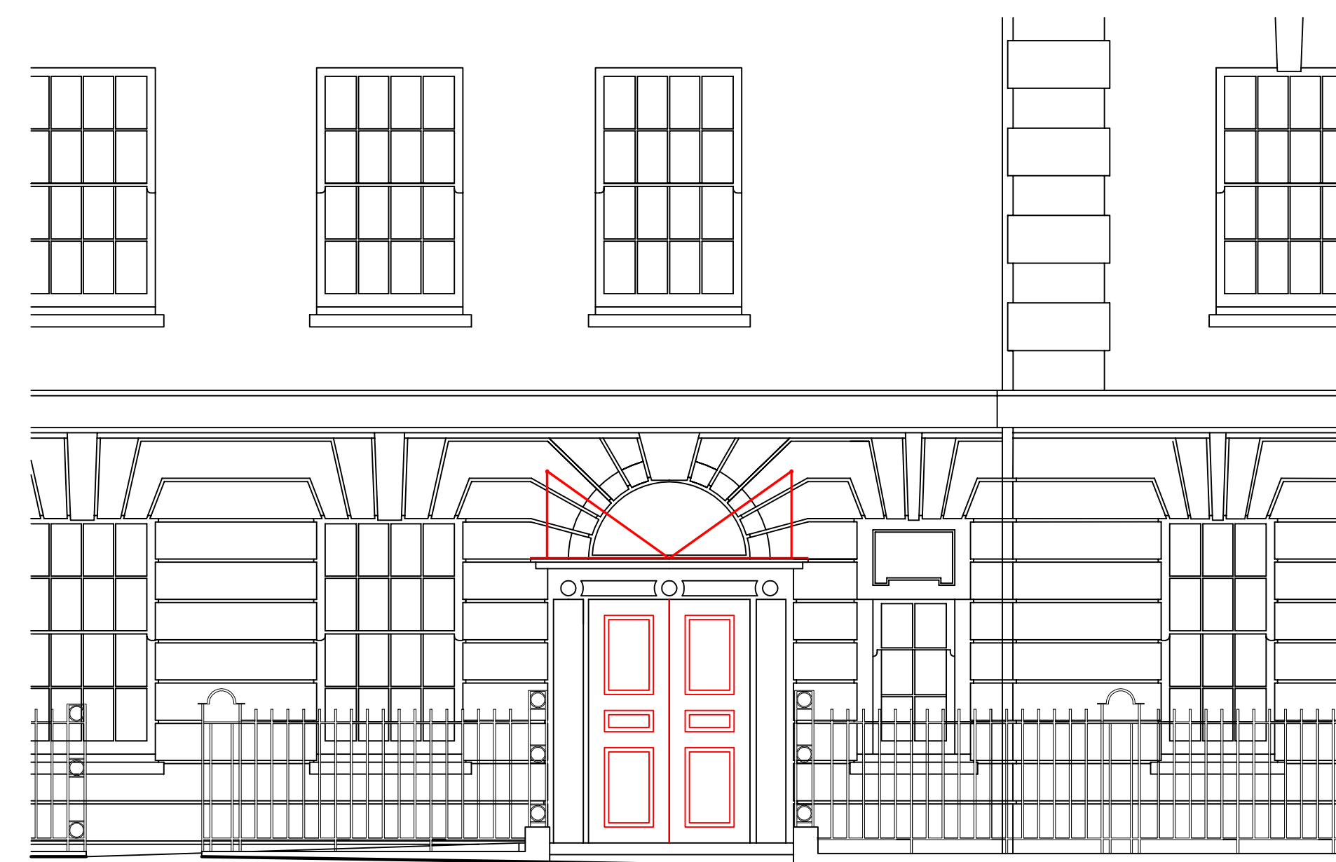
2 South Elevation - Hastings Street Disabled Access Entrance, Western Door - As Proposed Scale 1:50