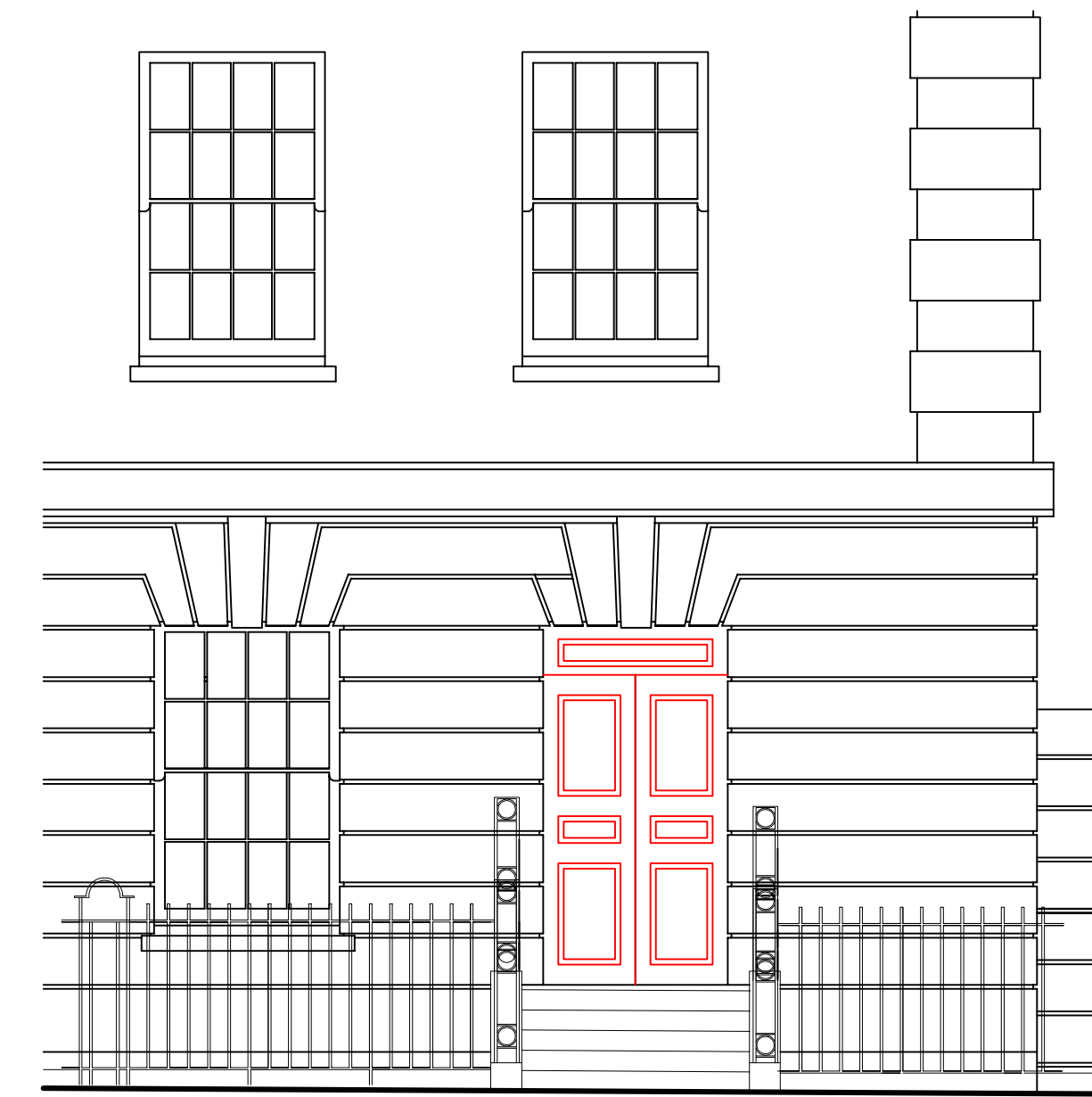
4 South Elevation - Hastings Street, Eastern Door - As Proposed Scale 1:50