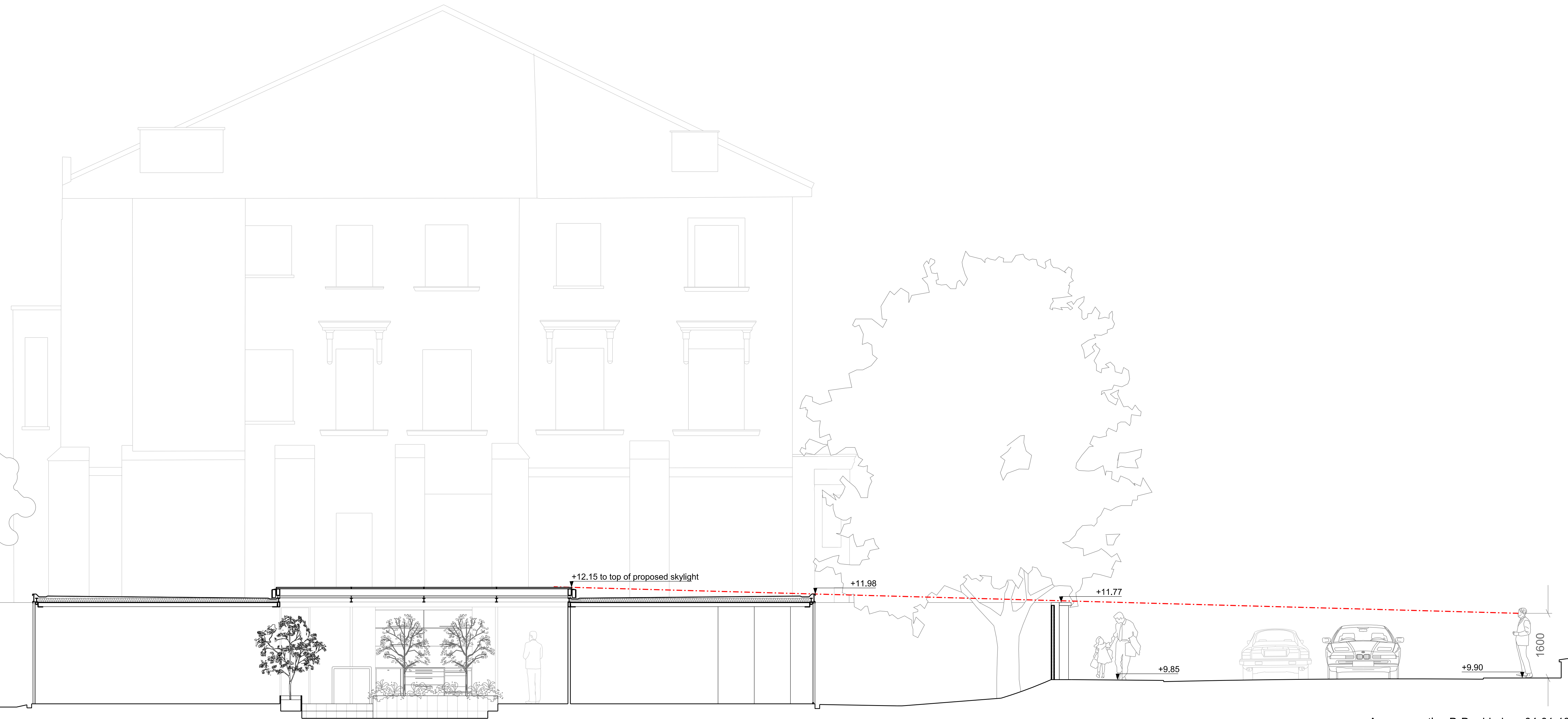
PROPOSED SECTION C-C

DO NOT SCALE FROM THIS DRAWING. ALL DIMENSIONS TO BE CHECKED ON SITE. COPYRIGHT RESERVED.