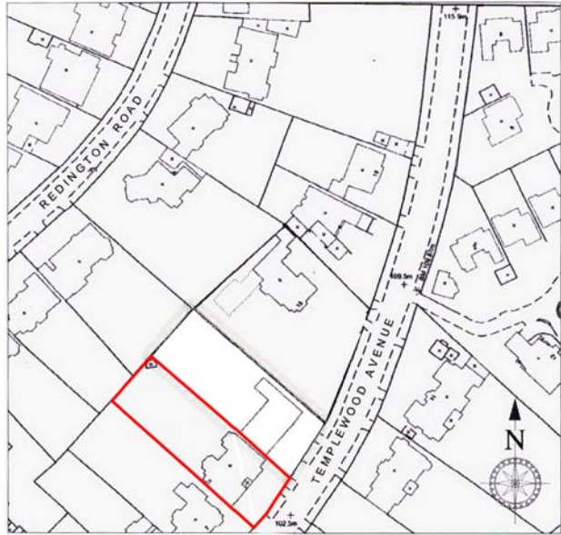
EXISTING LOCATION PLAN SCALE 1:1250@A1 EX-01