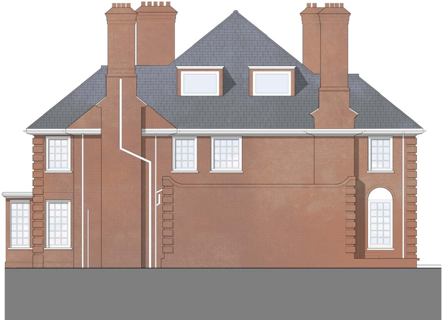
EXISTING NORTH-EAST ELEVATION SCALE 1:50@A1 EX-04