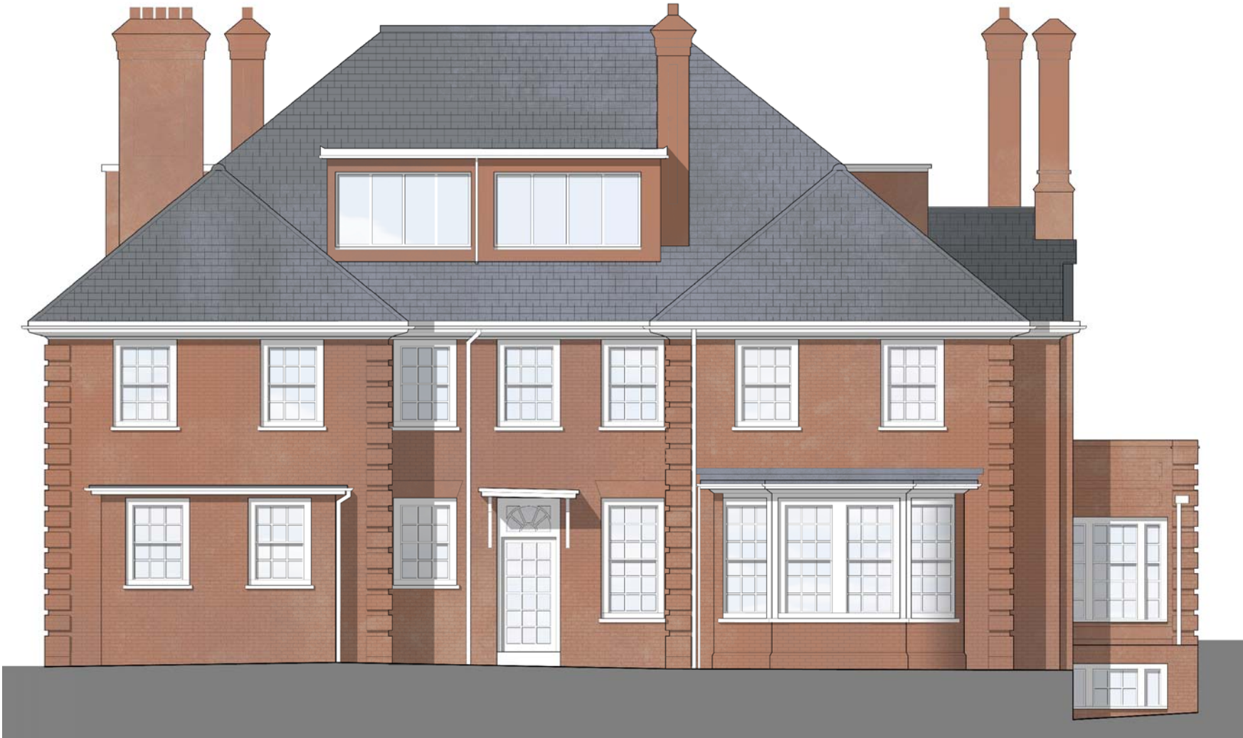
EXISTING NORTH-WEST ELEVATION SCALE 1:50@A1 EX-04