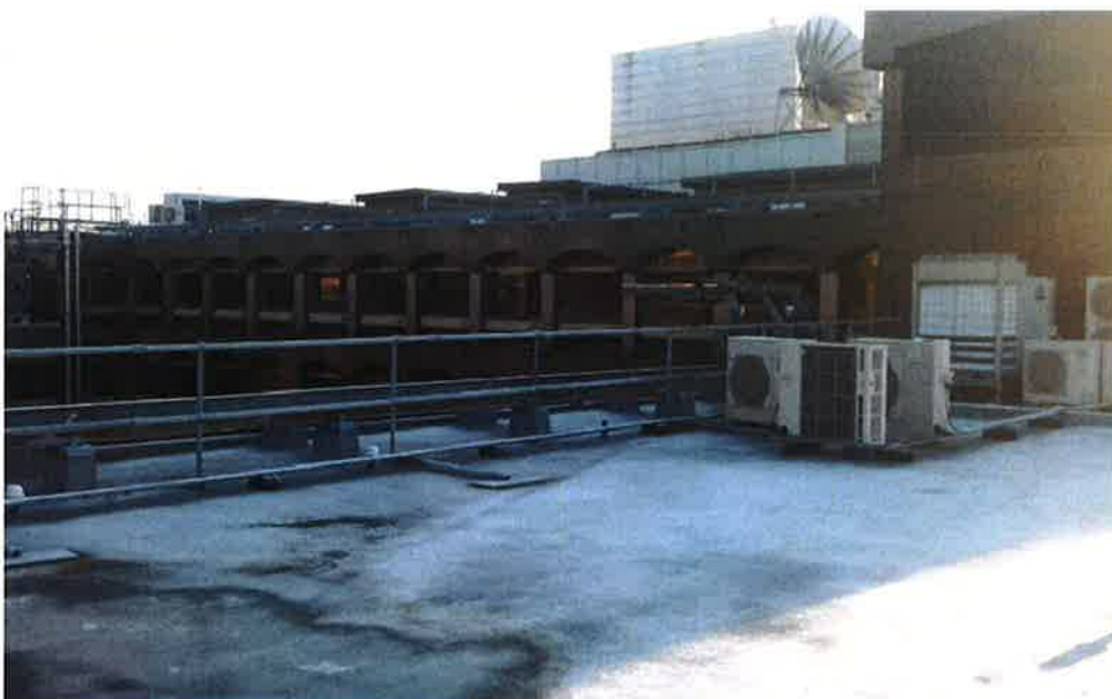
Existing condensers on 7th floor roof level and area for proposed new condensers.

Installation of new plant in the landlord designated area for our client's tenancy, adjacent to existing installation.