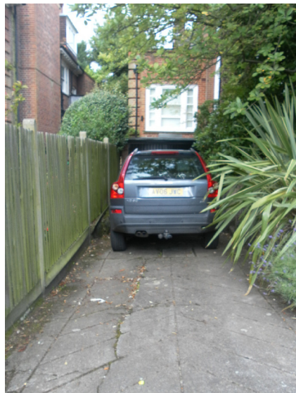
EXISTING FENCING TO GARAGE DRIVEWAY SCALE NTS@A1 AD-02.2