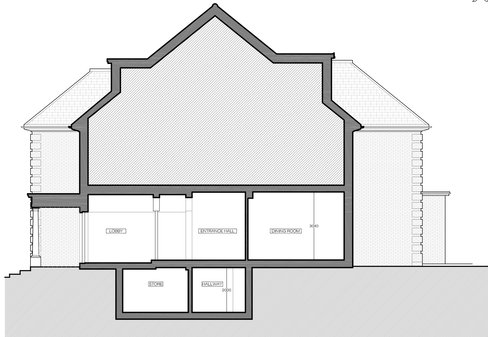
EXISTING SECTION B-B SCALE 1:50@A1 EX-05