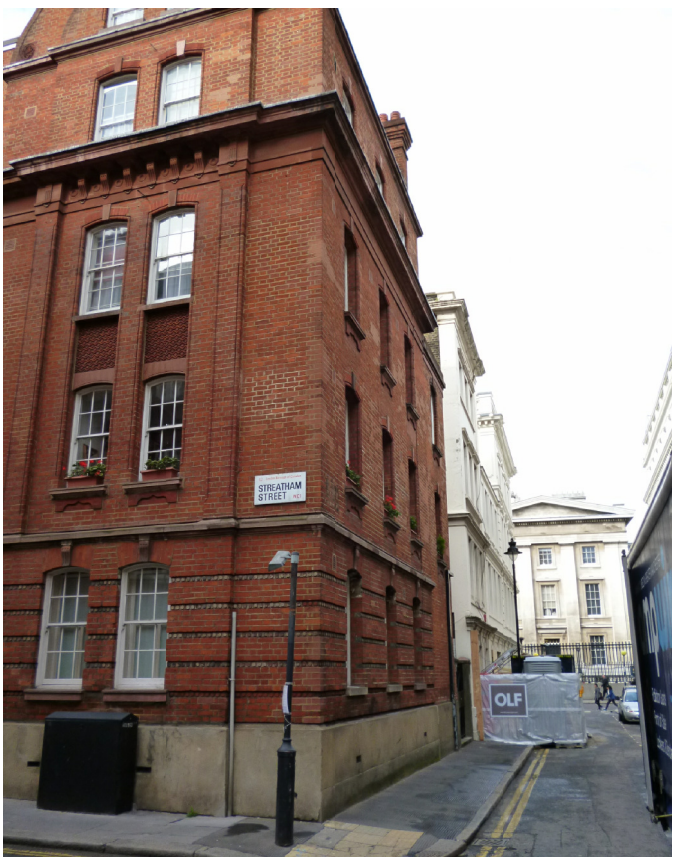
Corner Streatham Street and Coptic Street