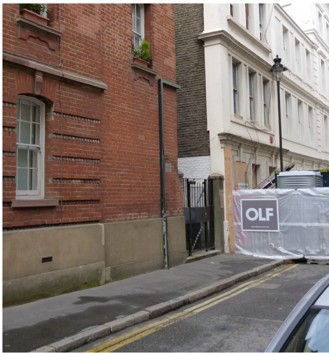
Coptic Street - view north