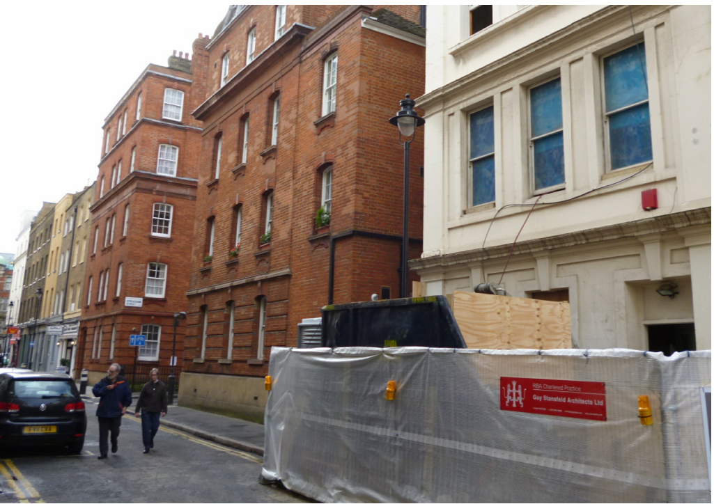
Coptic Street - view south