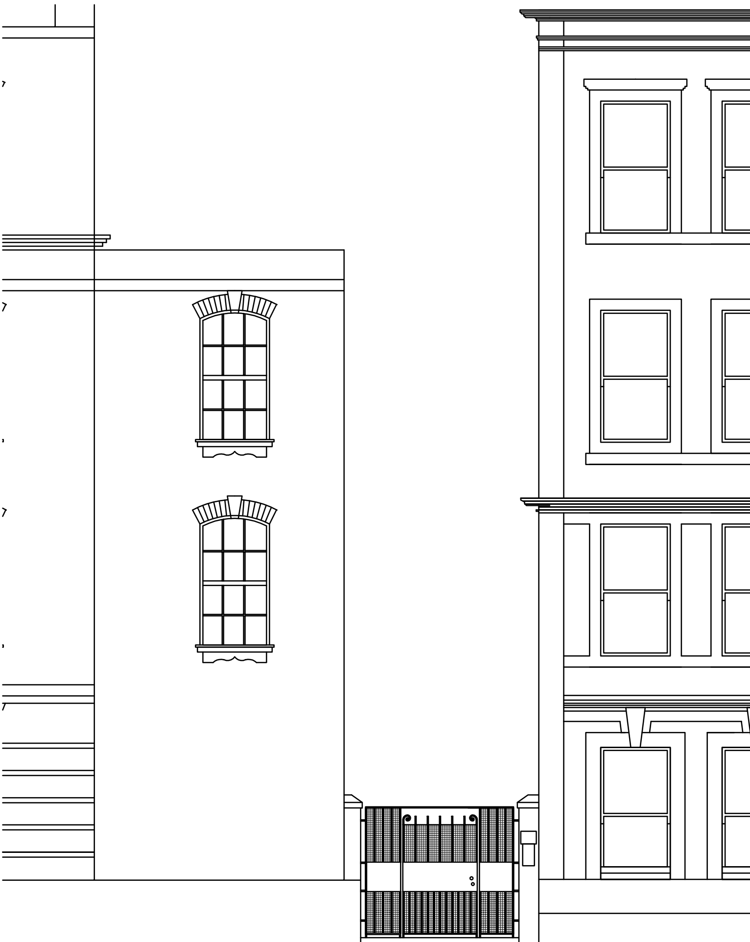
Scale 1/50 @ A1