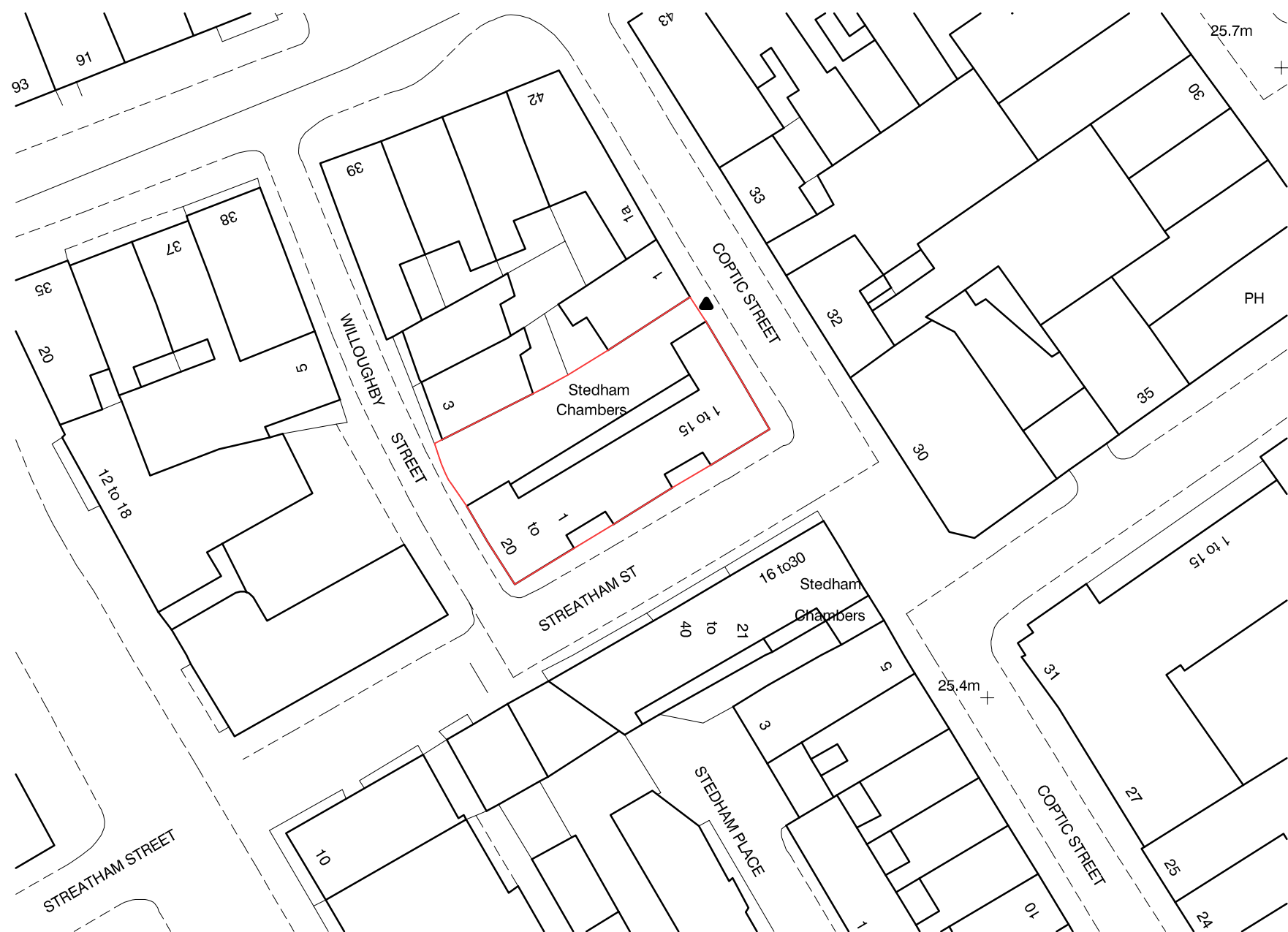
Plan Scale 1/500 @A1