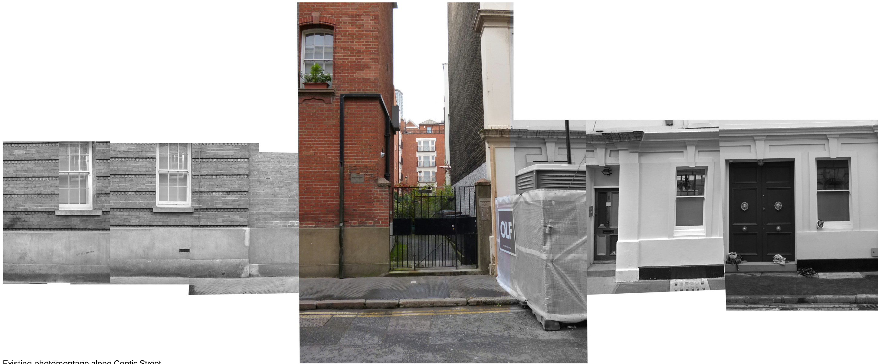
Existing photomontage along Coptic Street