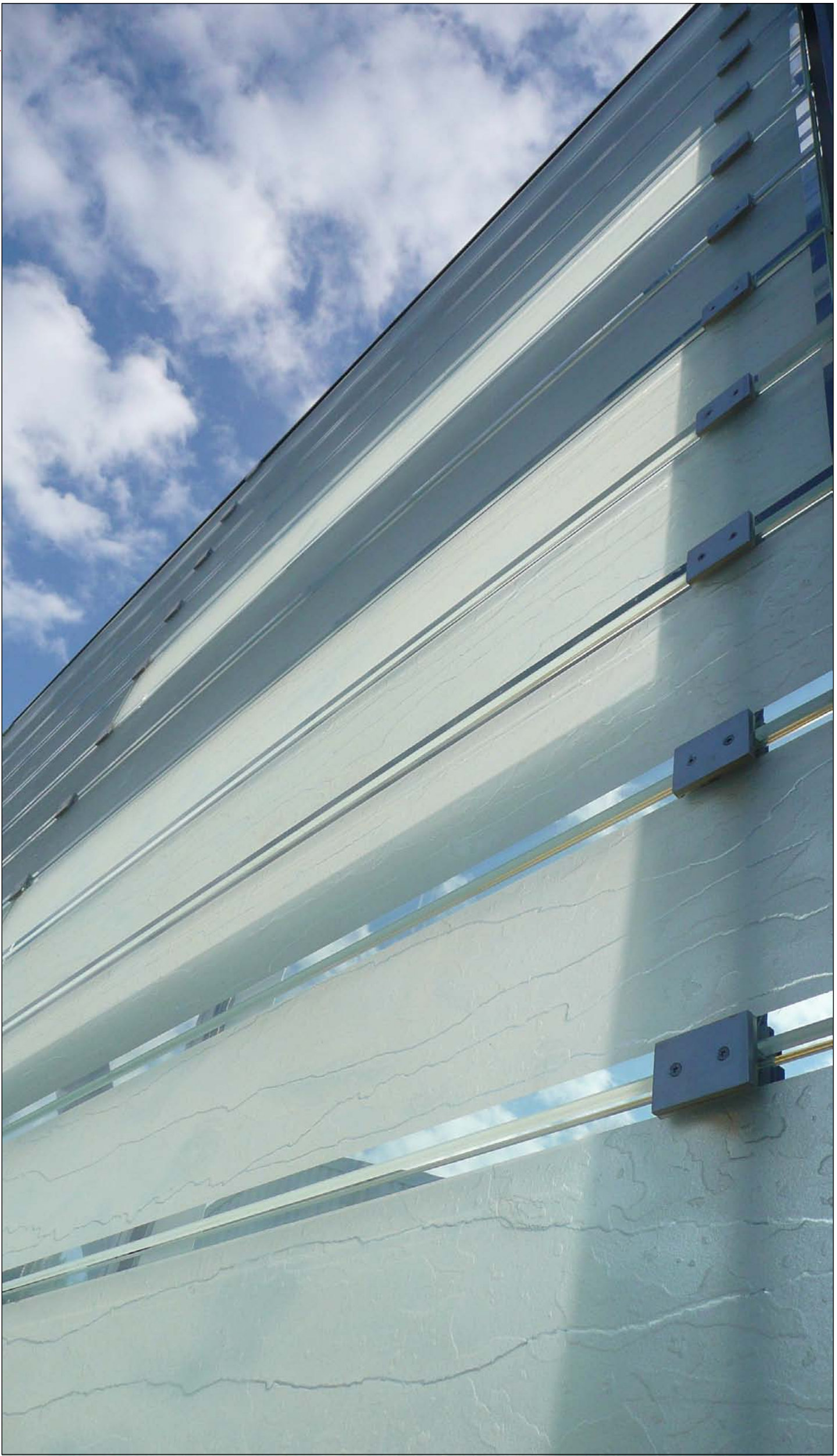
Fig. P1070257 CAST GLASS FACADE