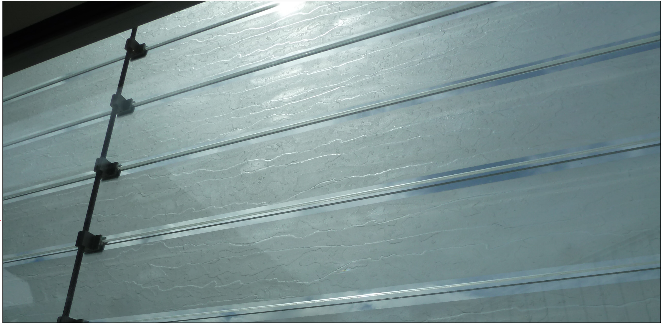
Fig. P1020602 INTERNAL VIEW OF CAST GLASS FACADE