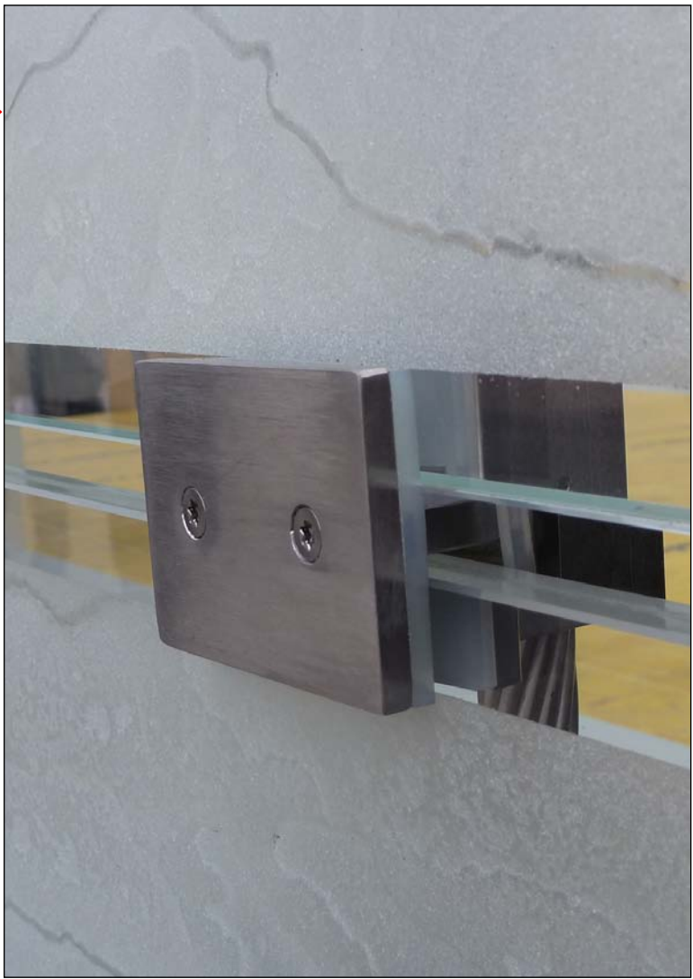
Fig. P10200575 PATCH FITTING