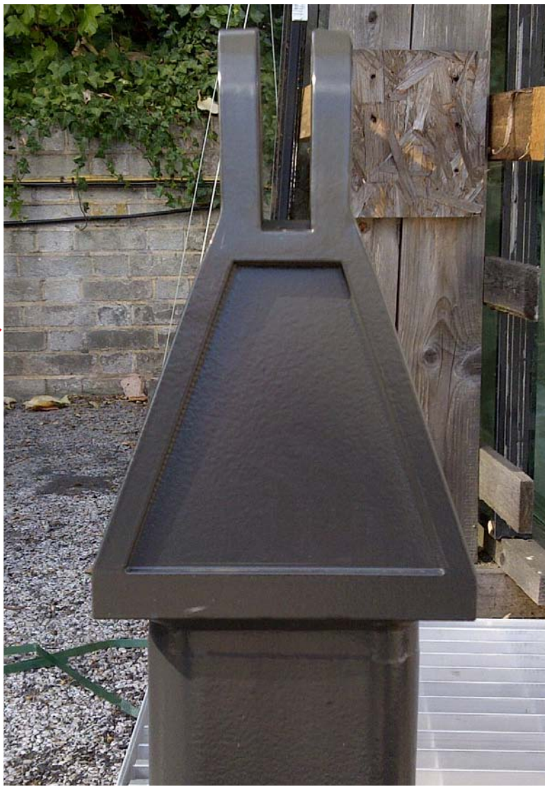
Fig. IMG 00055 BASE SUPPORT

UPDATED VISUALISATION EXTRACT FROM PLANNING DRAWING 5370-FD-DB-702 DETAILED BAY LIFT CORE + NORTH/WEST CLADDING NTS