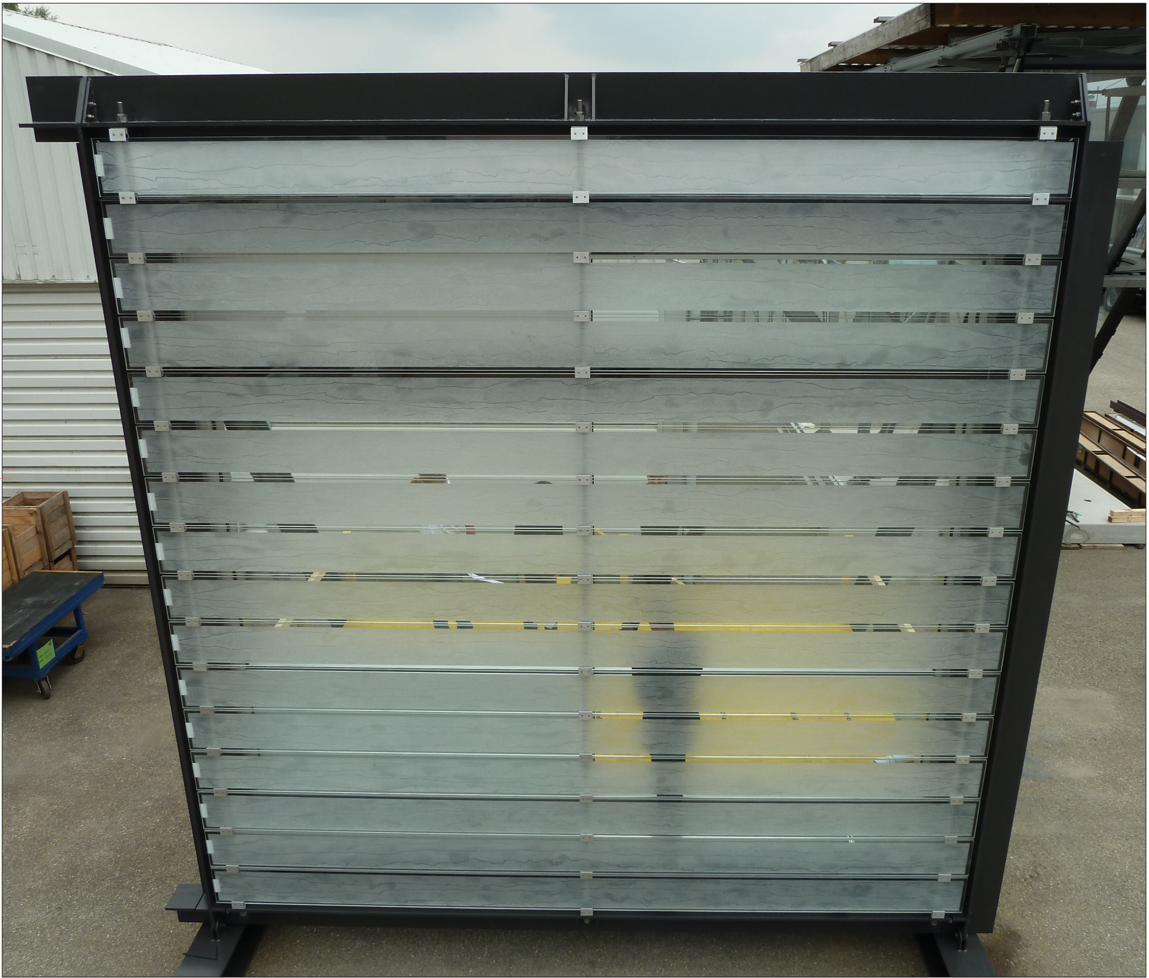
Fig. P1020538 'MOCK-UP' OF CAST GLASS CLADDING BAY

UPDATED VISUALISATION EXTRACT FROM PLANNING DRAWING 5370-FD-DB-702 DETAILED BAY LIFT CORE + NORTH/WEST CLADDING NTS