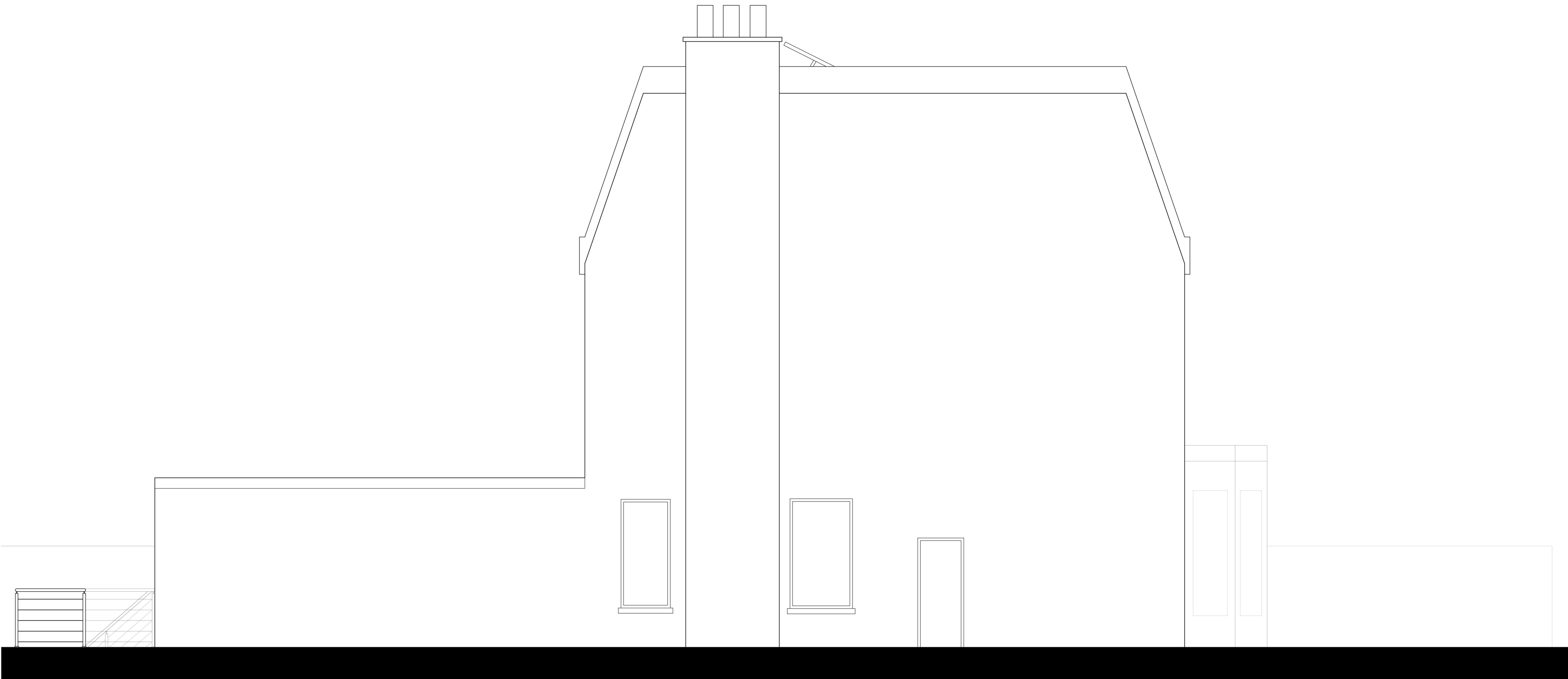
WEST ELEVATION (HOUSE): AS PROPOSED